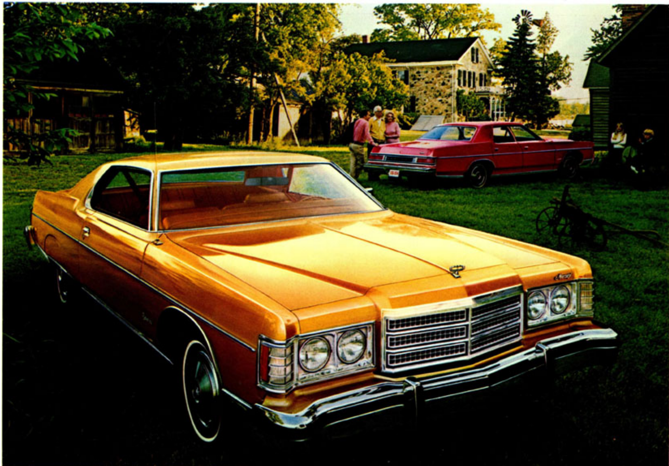
Rear: Montcalm 4-door pillared hardtop.