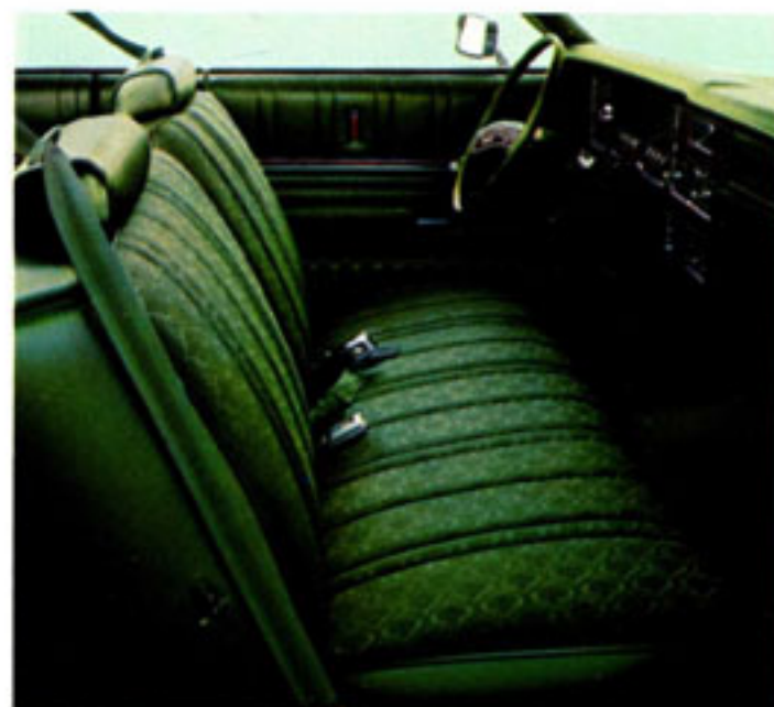
Above: Rideau 500 standard interior in Barletta cloth and vinyl.

And you have the opportunity to add a little taste of your own to your new Rideau 500. There's a list of optional equipment including: tinted glass, digital clock; visibility light group; fingertip speed control; and much more. Your Mercury dealer will be pleased to tell you all about them. Meteor Rideau 500. Basically, a true value car.