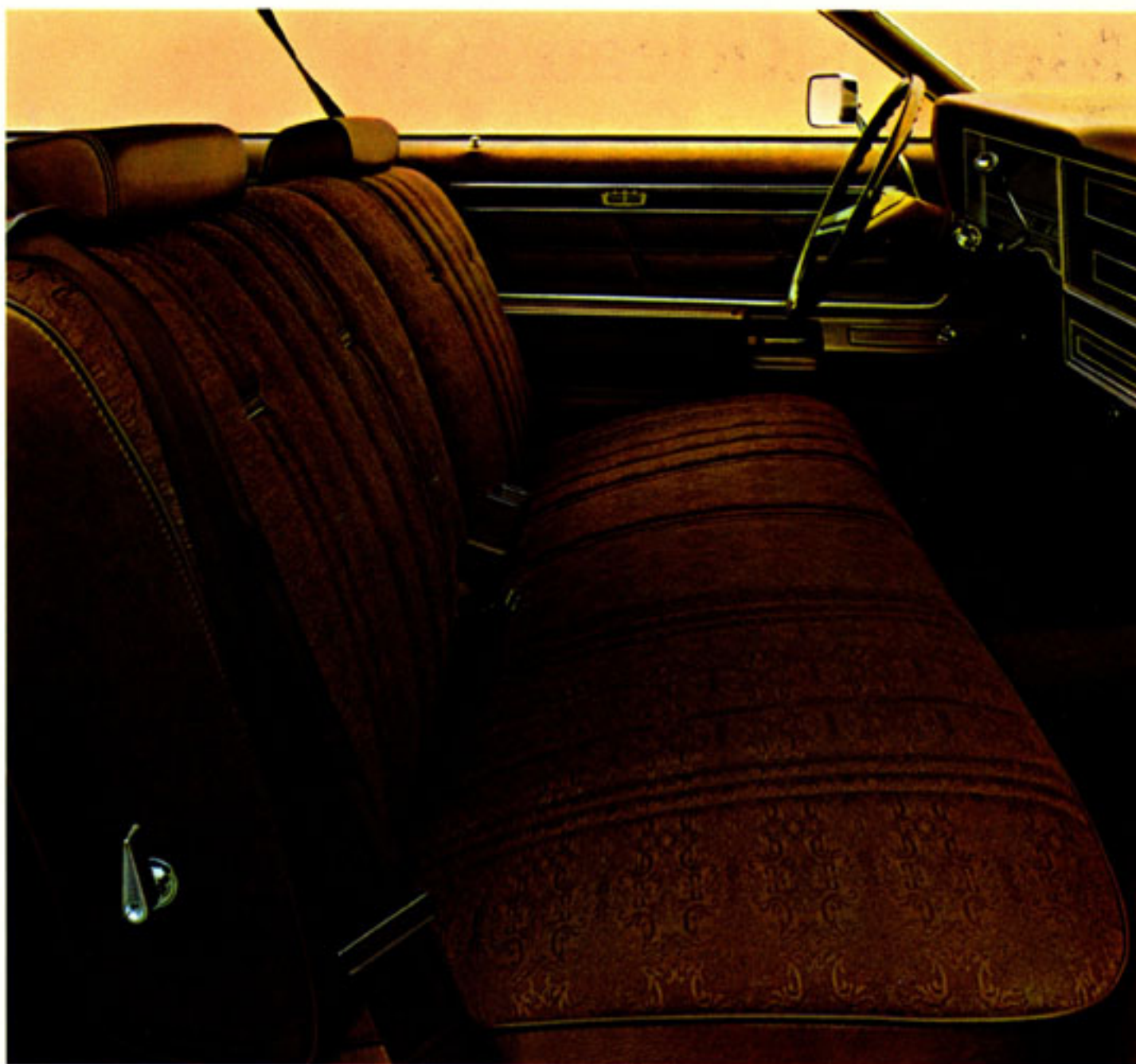
Below: Meteor Montcalm 4-door pillared hardtop.