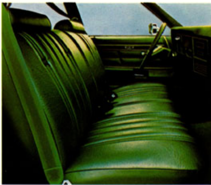
Above: Montcalm optional all vinyl interior.