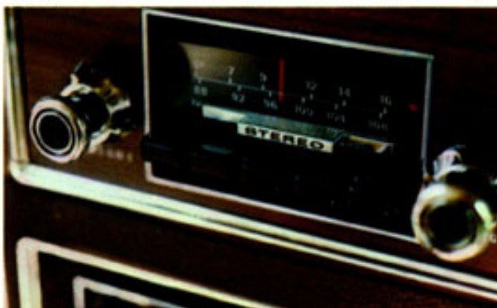
Below: Optional AM/FM multiplex stereo radio (requires power antenna at extra cost).