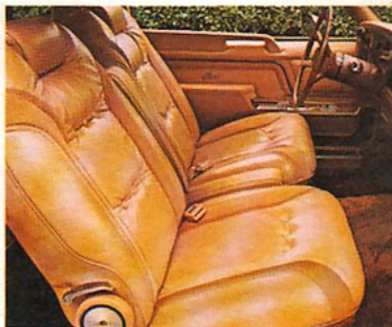
Pacer Limited interior — Leather/Corduroy