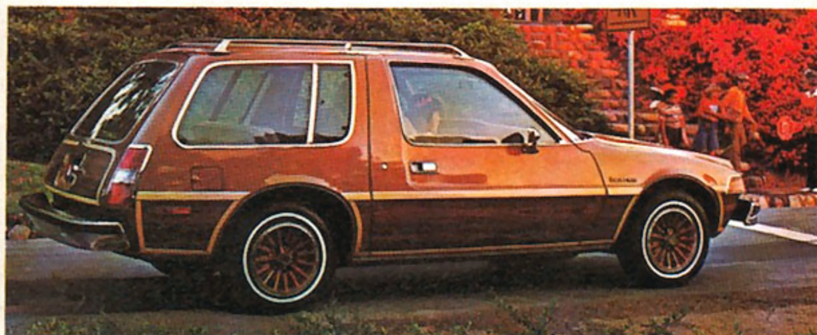
Pacer Limited Wagon

AMC Pacer Hatchback — an exceptional blend of big car room, ride and comfort.