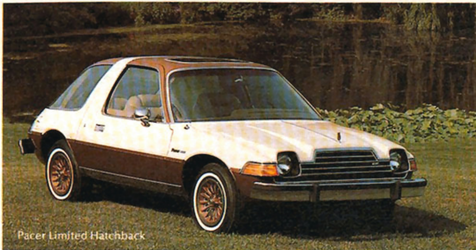
Pacer Limited Hatchback