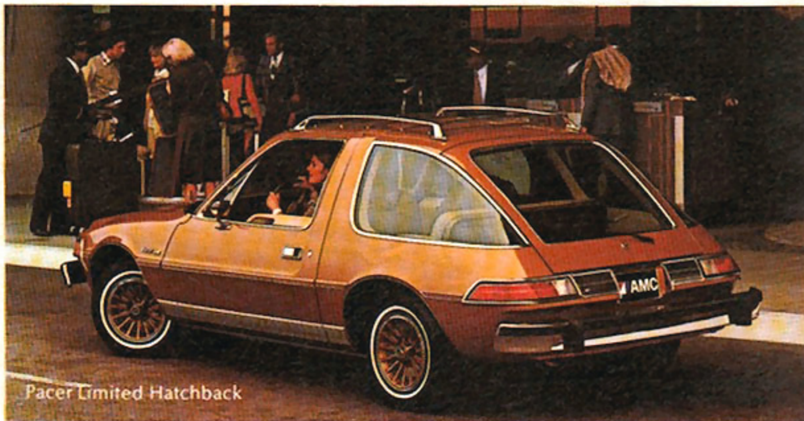
Pacer Limited Hatchback