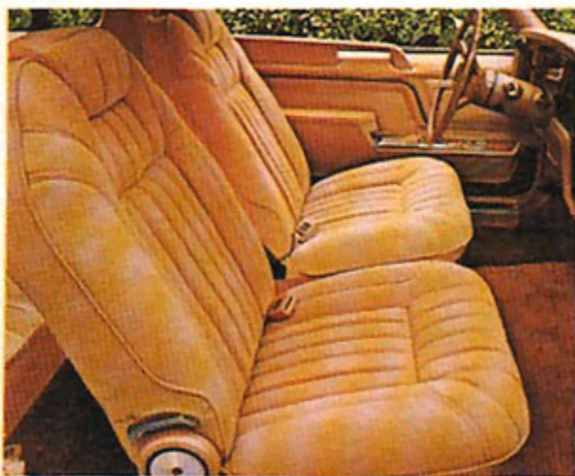
Pacer DL interior — Caberfae Corduroy