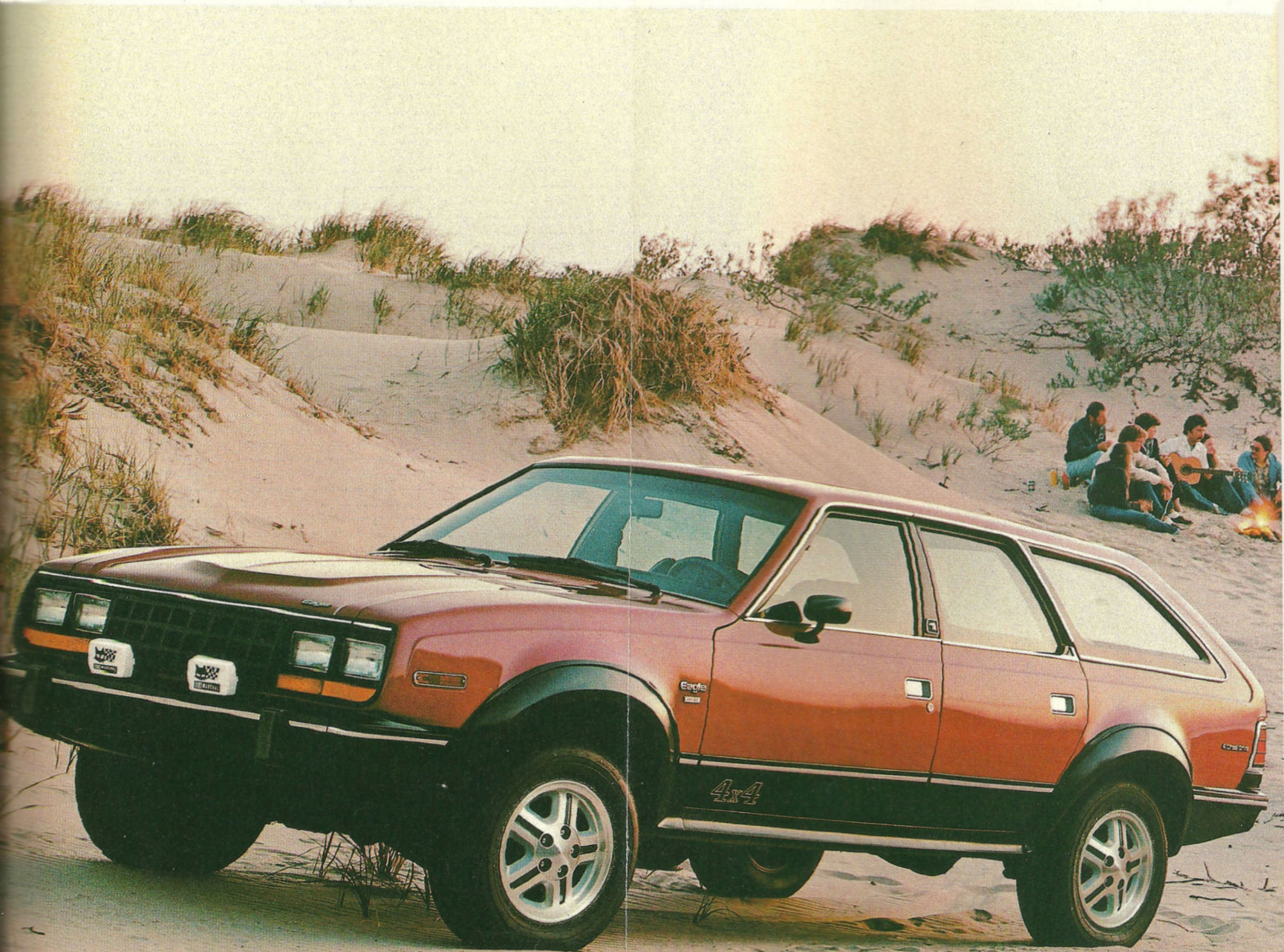
Eagle Wagon with Sport Package

Economical cars that are built to last are an American Motors tradition. For 1982, AMC Concord, Spirits, and the amazing 2-wheel drive/ 4-wheel drive American Eagles feature Ziebart® factory rust protection with galvanized steel in 100% of the exterior body panels, the industry's first 5-year No Rust-Thru Warranty and the famous AMC Buyer Protection Plan.®