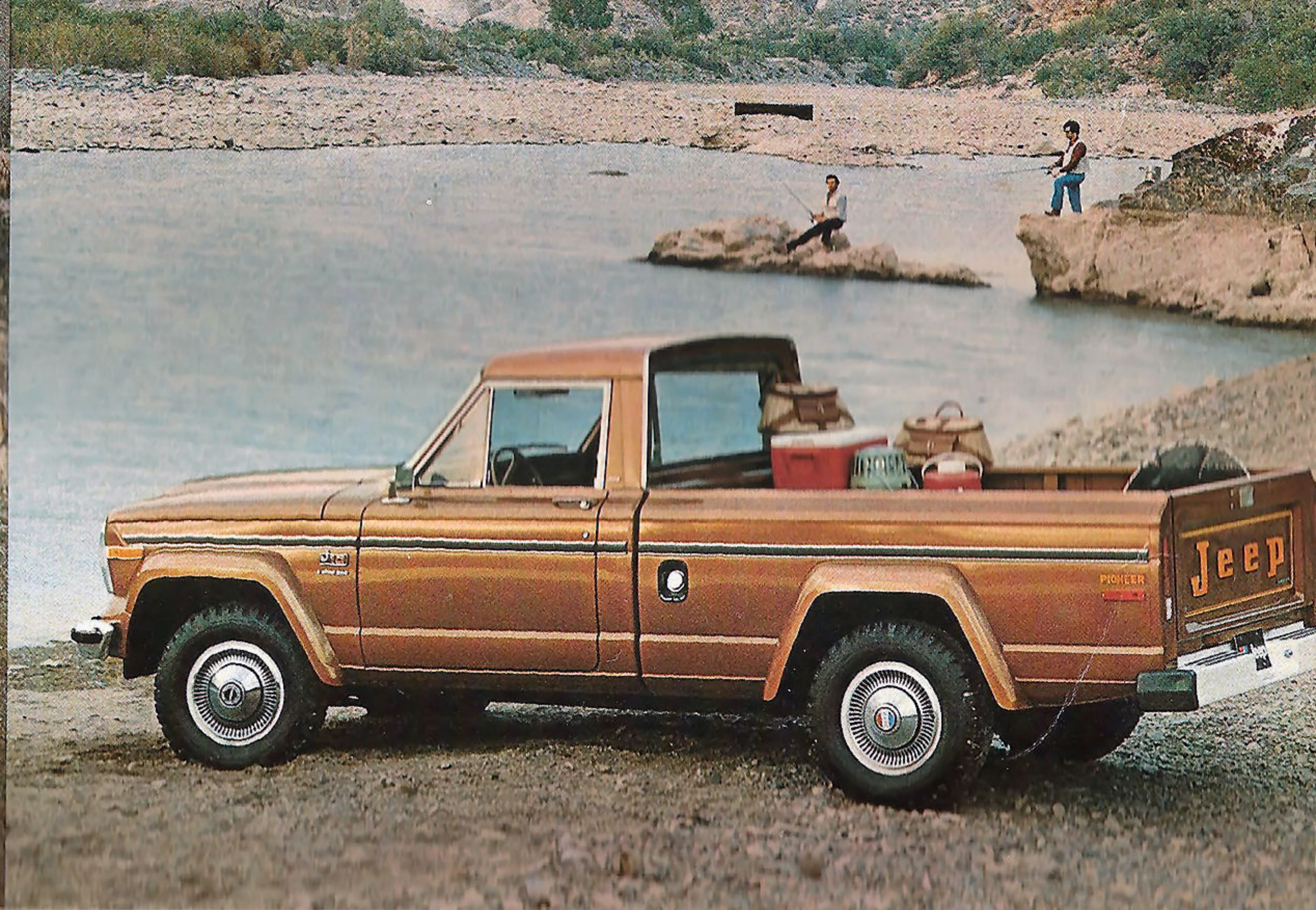
Jeep J-10 Pioneer Pickup