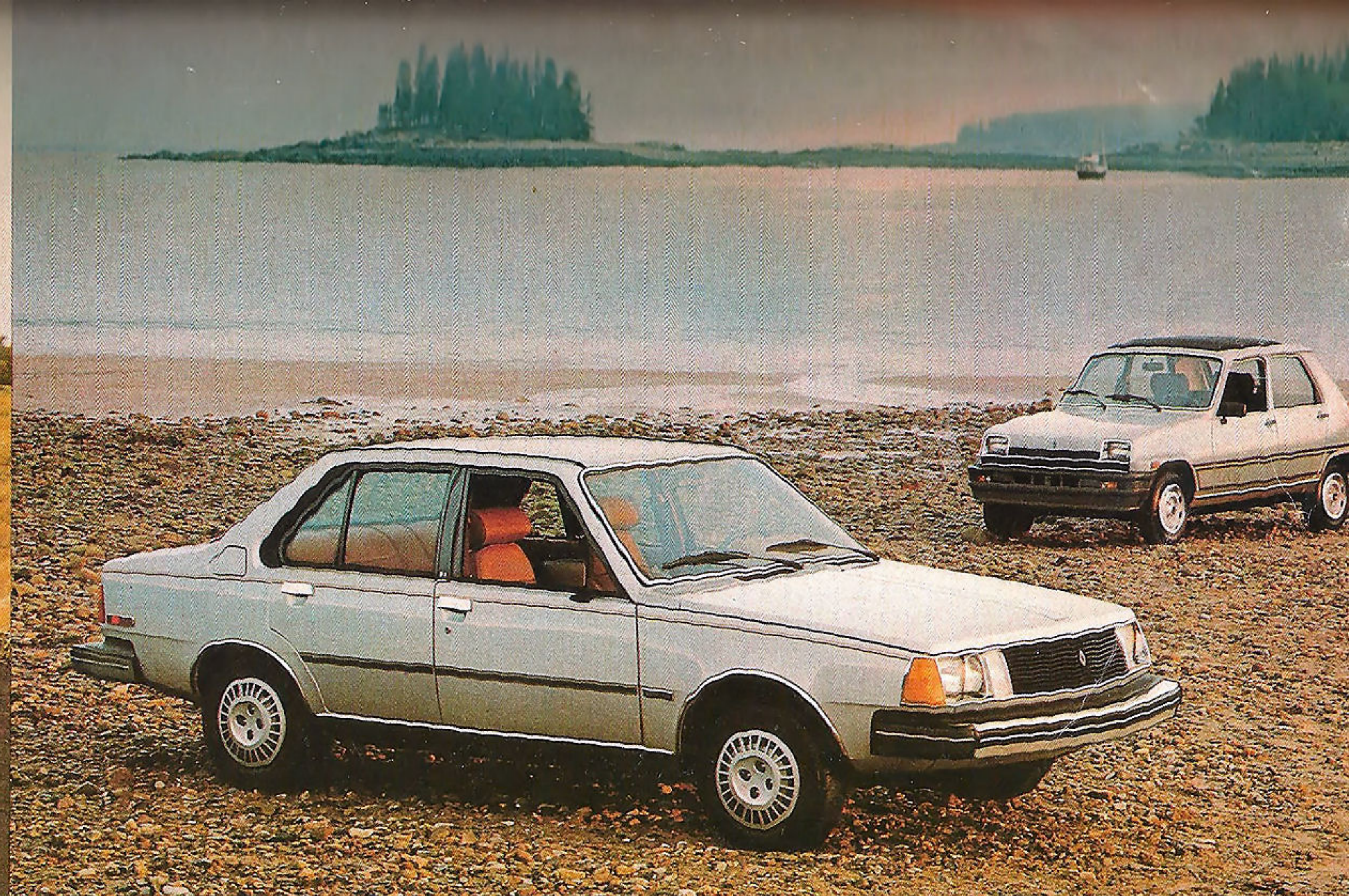
Renault 18 i 4-Door Sedan and Renault Le Car Deluxe 5-Door