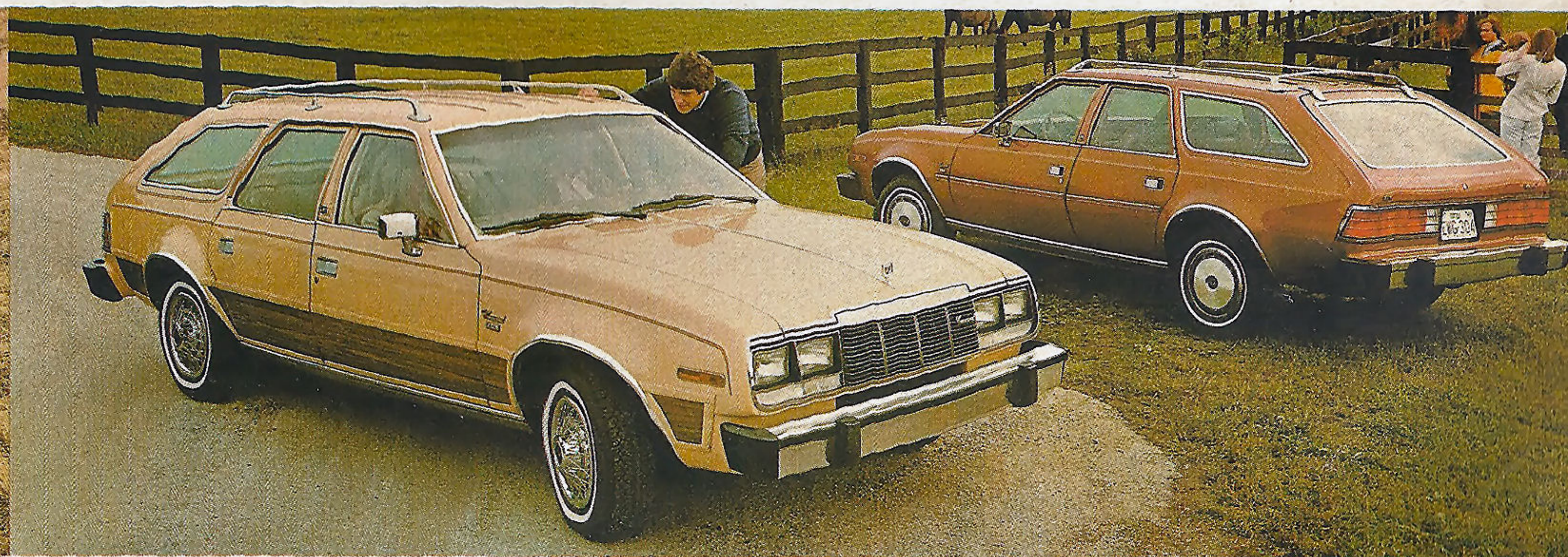
Concord DL Wagons