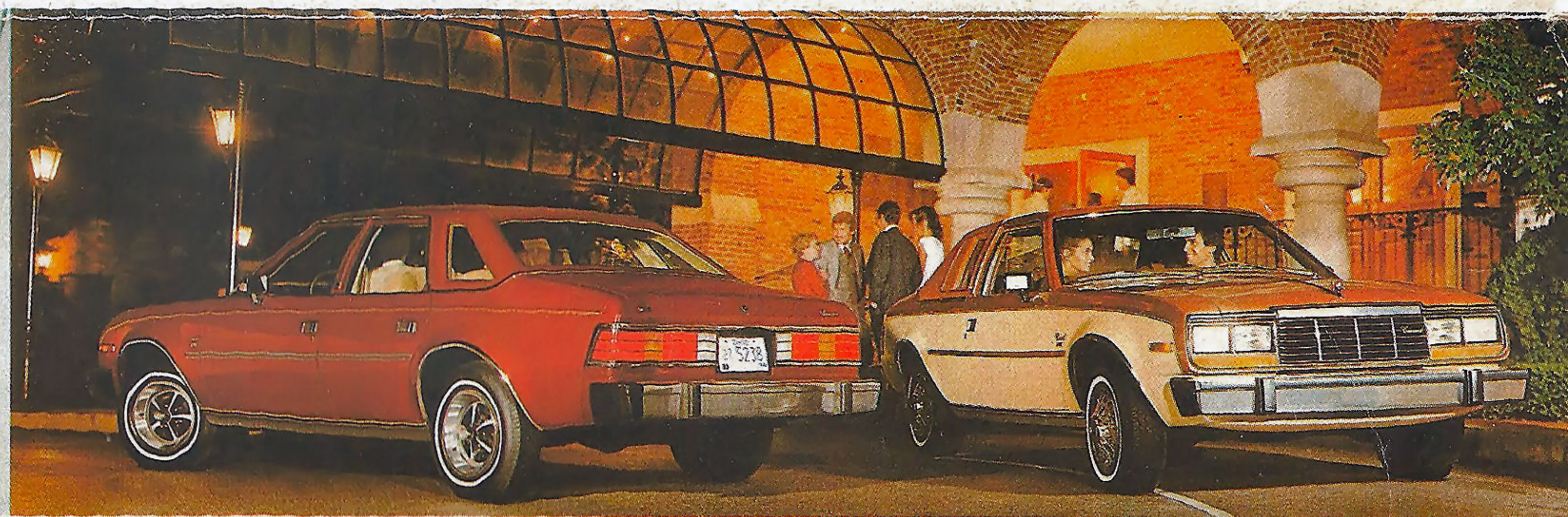
Concord DL 4-Door Sedan and Concord Limited 2-Door Sedan