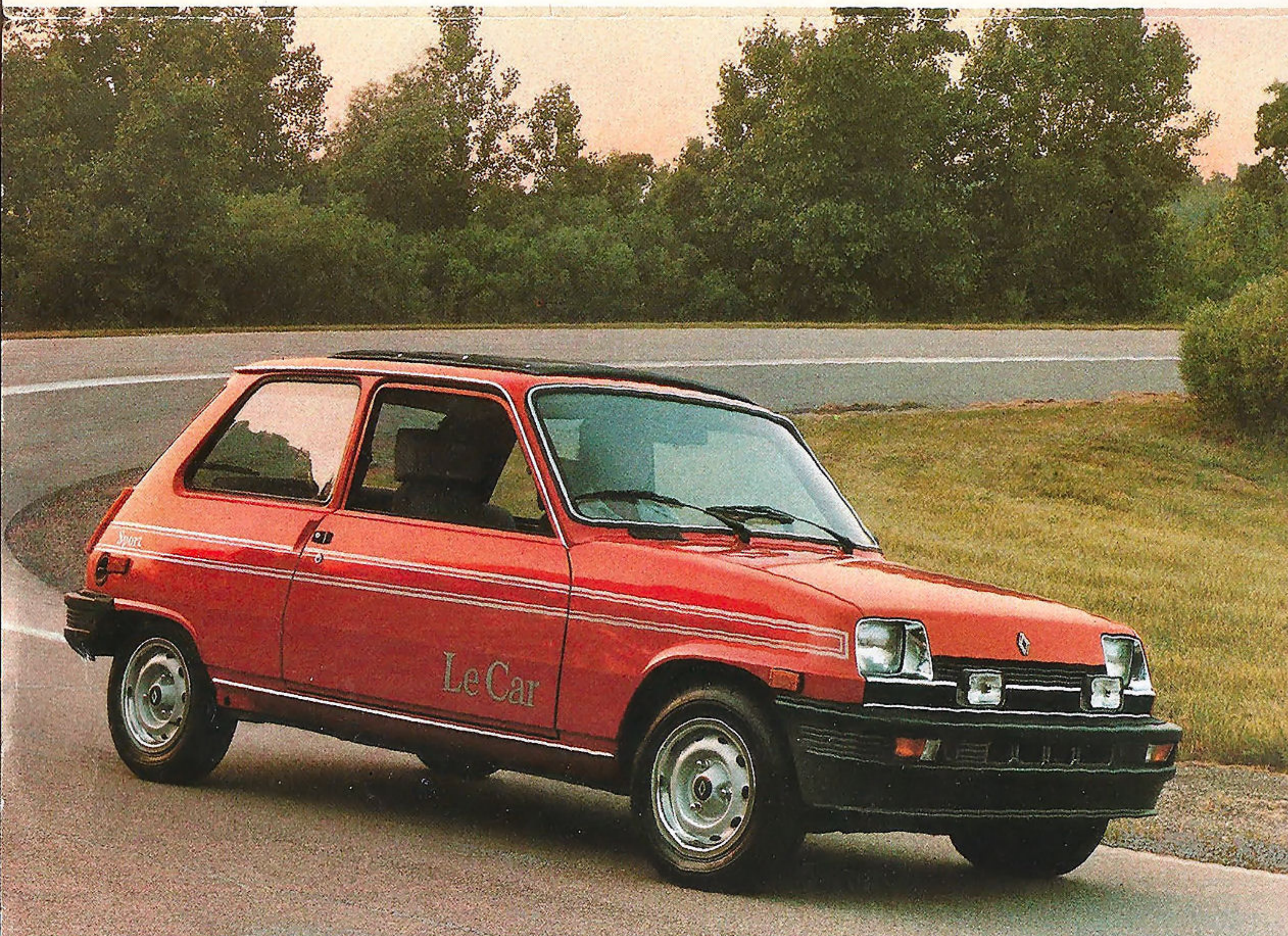
Renault Le Car Sport 3-Door