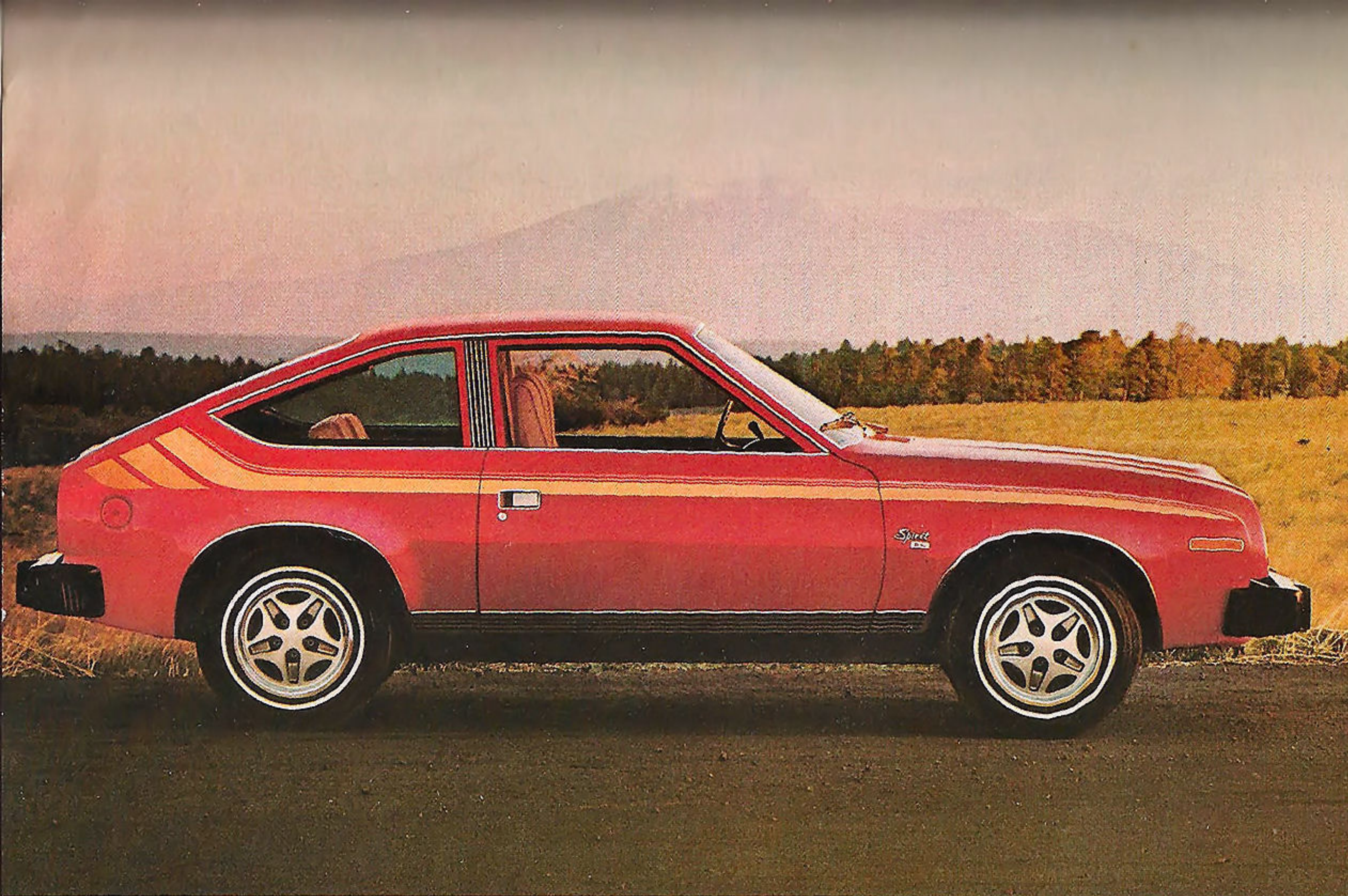
Spirit DL Liftback