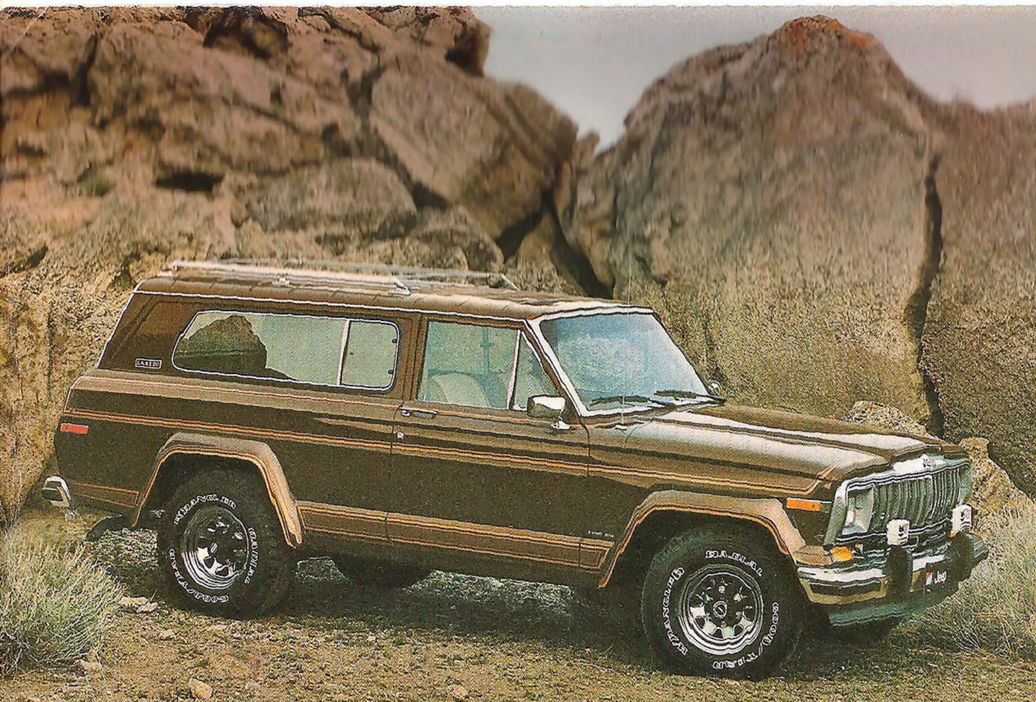
Jeep Cherokee Laredo 2-Door