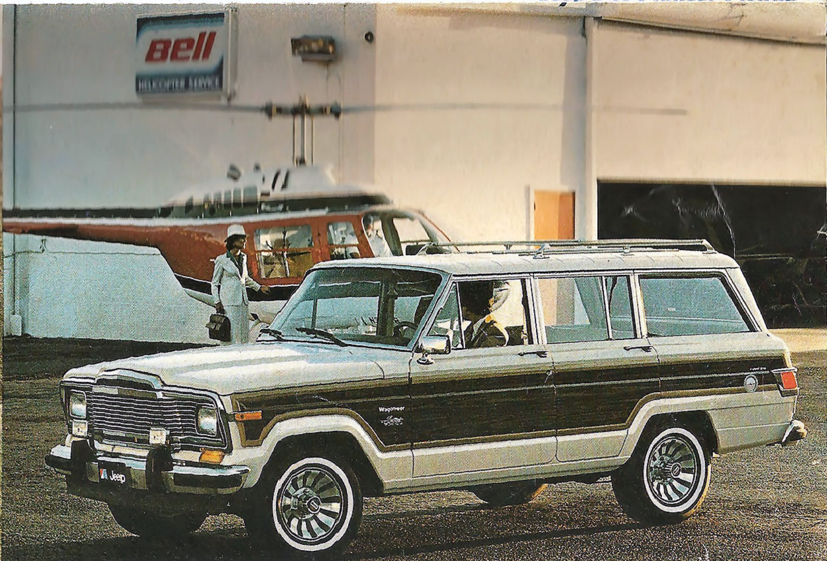
Jeep Wagoneer Limited