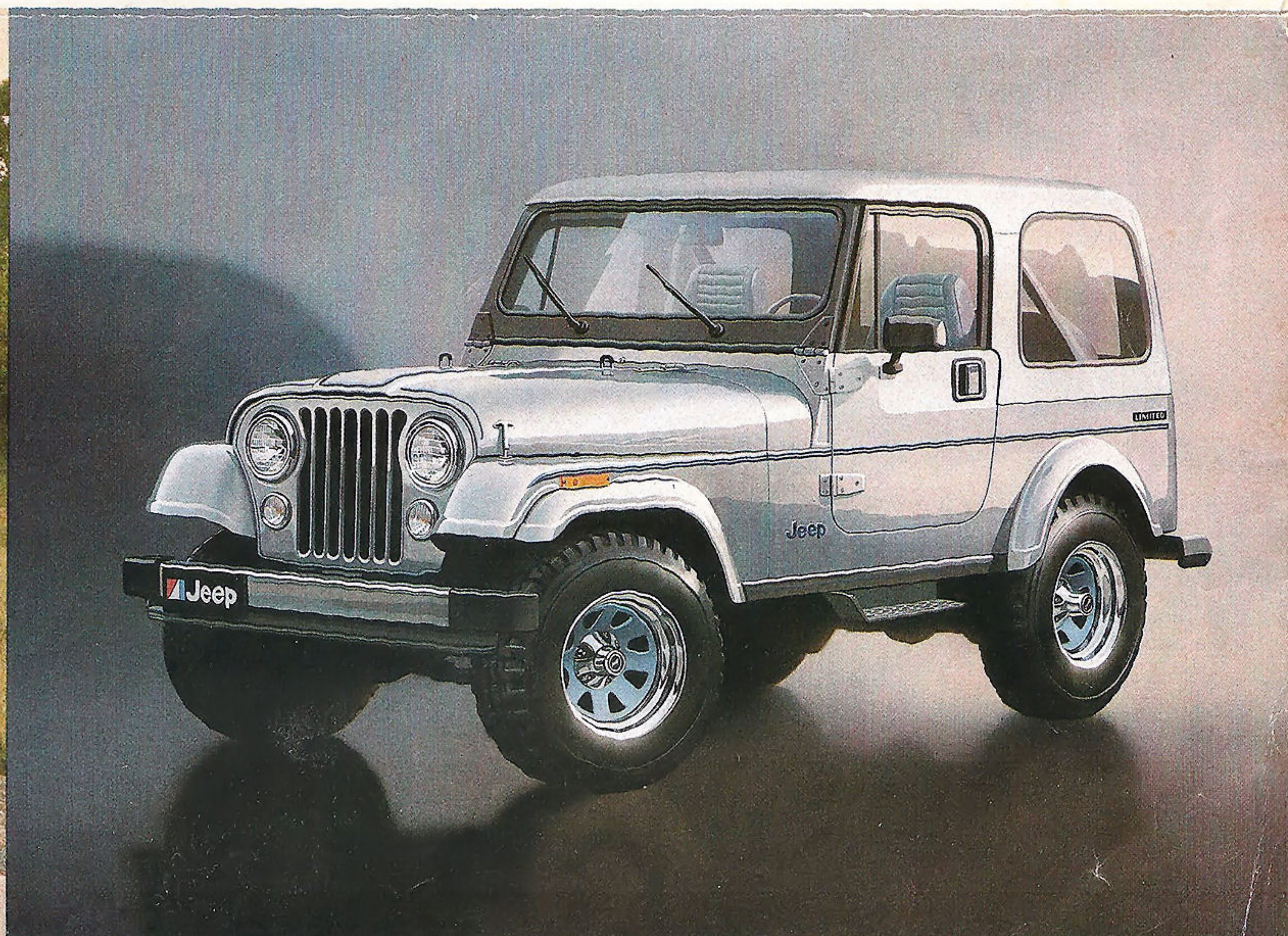
Jeep CJ-7 Limited