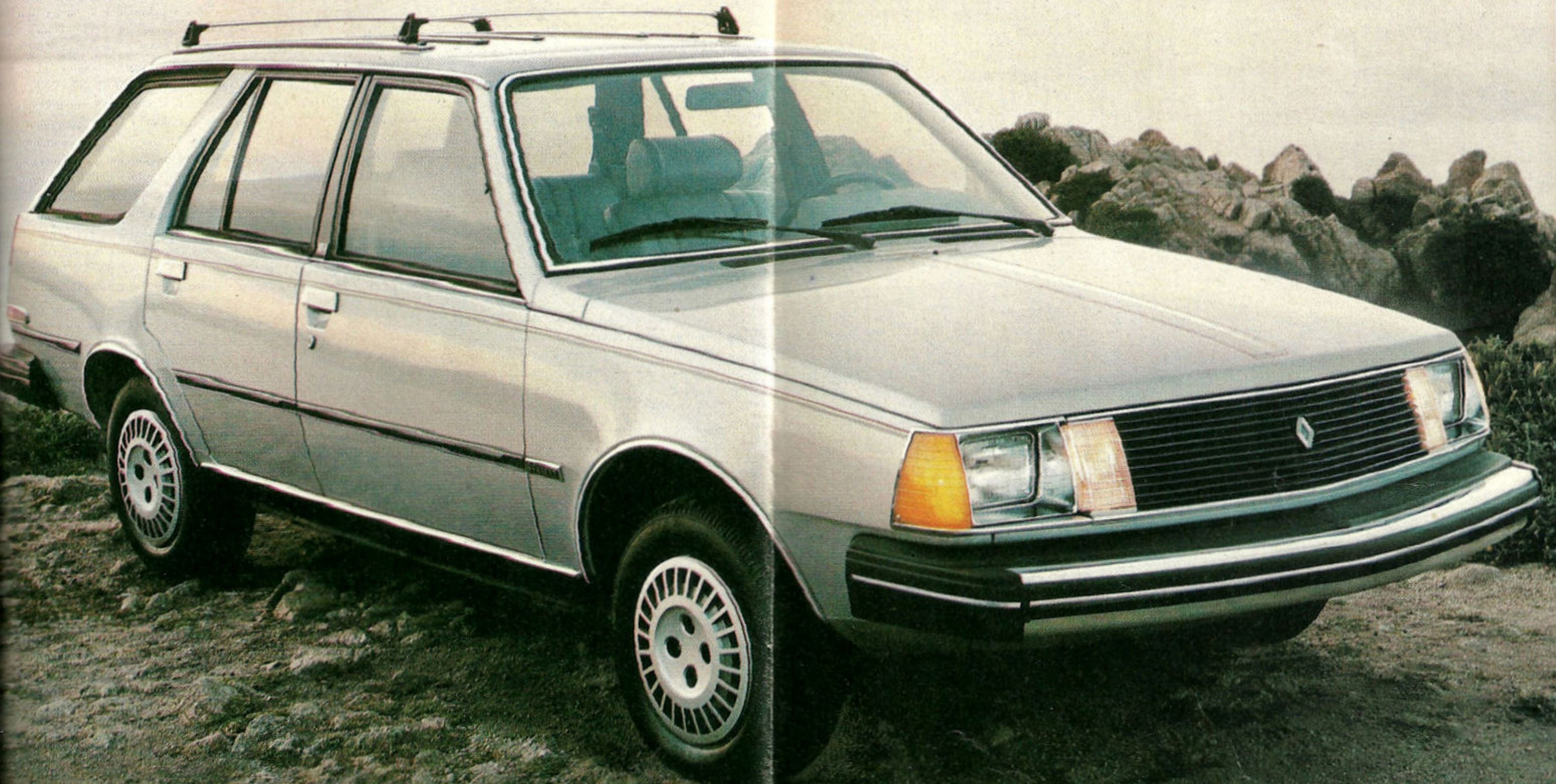
Renault 18i Wagon

For 1982, front wheel drive Renault Le Car and Renault 18i offer advanced technology and superb engineering. Renault's mastery of the science and art of automotive engineering have helped it to become the best selling car name in Europe. That mastery is reflected in the fact that Renault cars sold in America are now completely covered by the famous American Motors Buyer Protection Plan.*