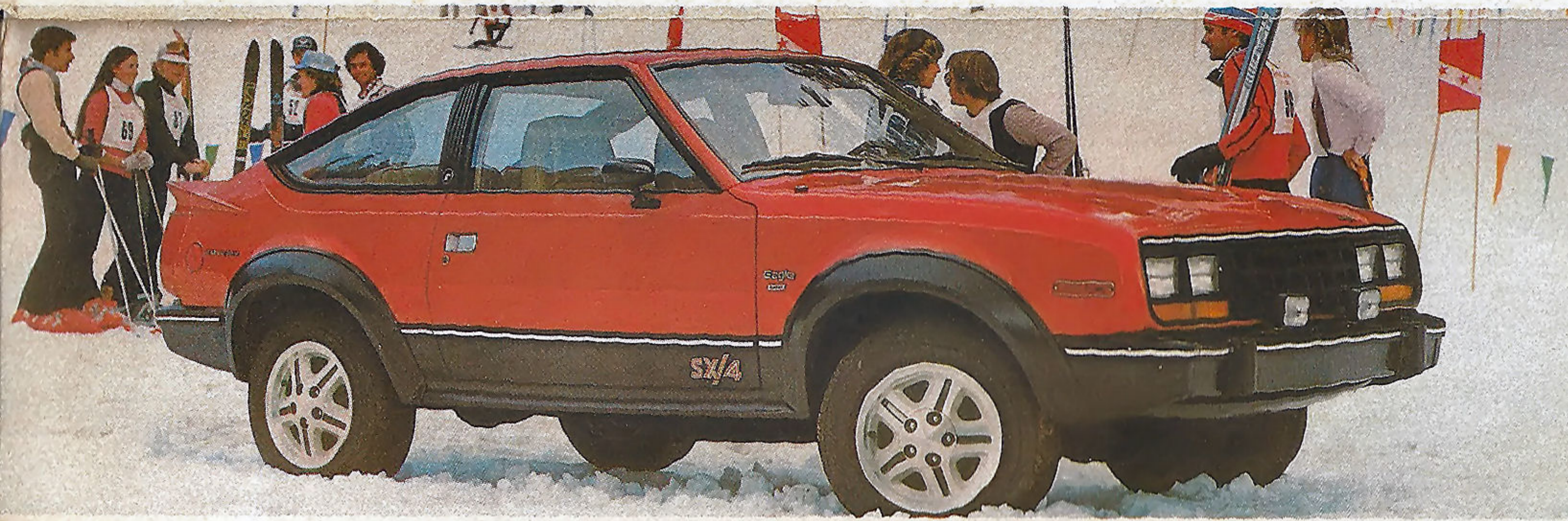
Eagle SX/4 Sport