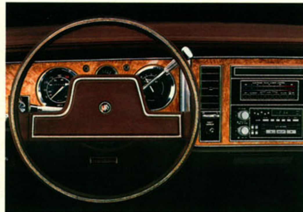
Instruments in Canada are metric where required.

To many people, the Electra is not merely a Buick. It is the Buick, pure and simple. Far be it from us to try to discourage such logic. In fact, we recognize this phenomenon as a tribute to what the Buick name has long represented: a tasteful balance