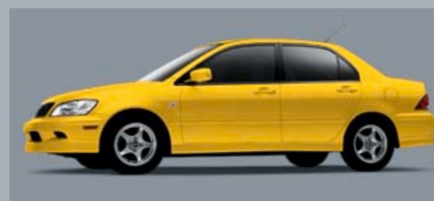
Shown in Lightning Yellow