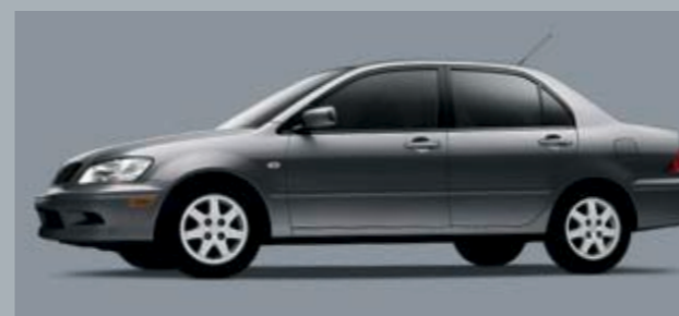
Shown in Thunder Gray Metallic