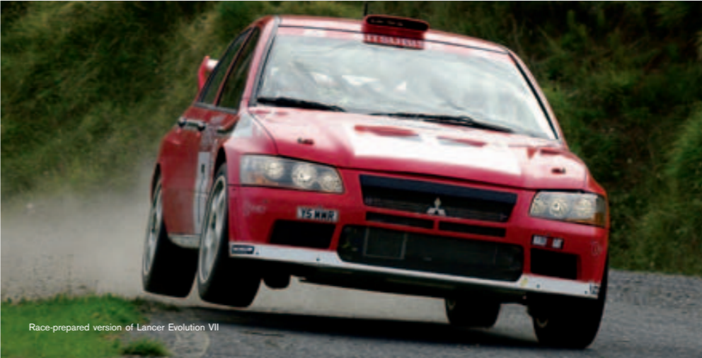
Race-prepared version of Lancer Evolution VII