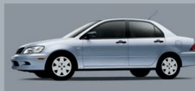
Shown in Munich Silver Metallic