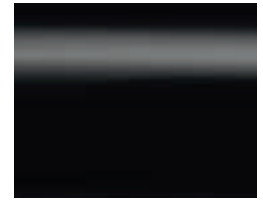
Grand Black Lacquer