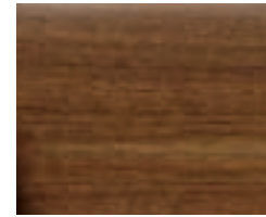
Straight Grain Walnut

Choice of interior finishes applied to the centre of the facia and upper door casings.