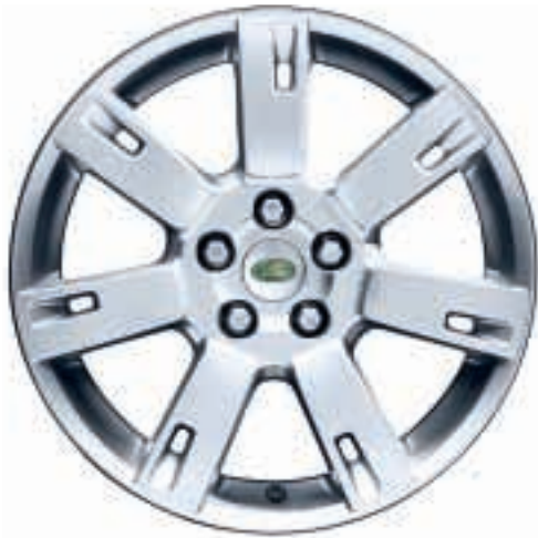
LR4 19 INCH 7-SPOKE ALLOY WHEELS Tire Specification: 255/55 AT