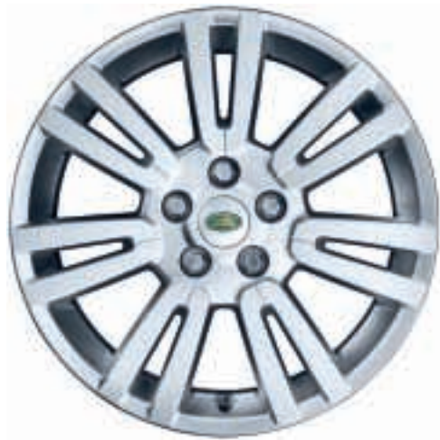
HSE 19 INCH 7-SPLIT SPOKE ALLOY WHEELS Tire Specification: 255/55 AT