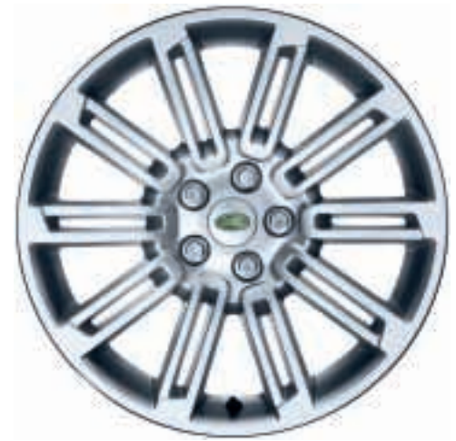
OPTIONAL 20 INCH 10-SPLIT SPOKE ALLOY WHEELS Tire Specification: 255/50 AT

Please note: When choosing vehicles fitted with specific wheel and tire combinations or optional wheels and tires, your intended use of the vehicle should be considered. Wheels with larger diameters and lower profile tires may offer certain styling or driving benefits, but may be more vulnerable to damage, please discuss your requirements with a Retailer when selecting your vehicle and specification.