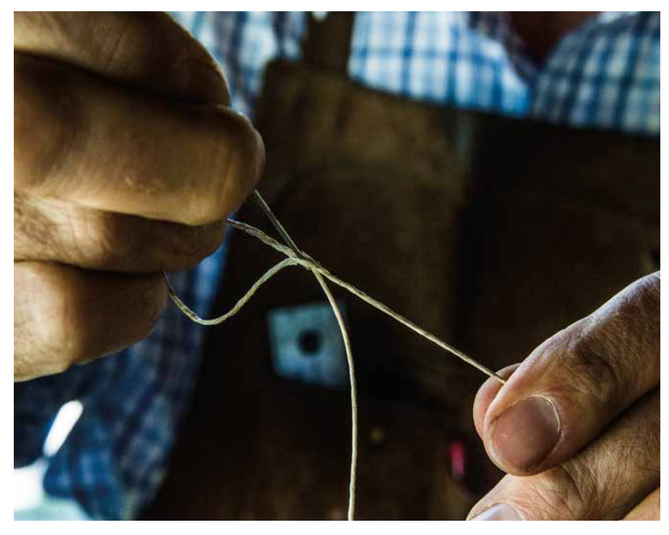
THE CRAFT COMES FROM THE HANDS. THE KNOWLEDGE THAT DELIVERS IT IS A GIFT.

The Maserati Ghibli's unique personality is also expressed in its luxurious cabin. The seats are upholstered in soft leather, which can also be specified for the dashboard and doors in dual color combinations for either a sporty or more elegant interior look. Exquisite leather stitching reflects the very finest traditions of Italian craftsmanship.