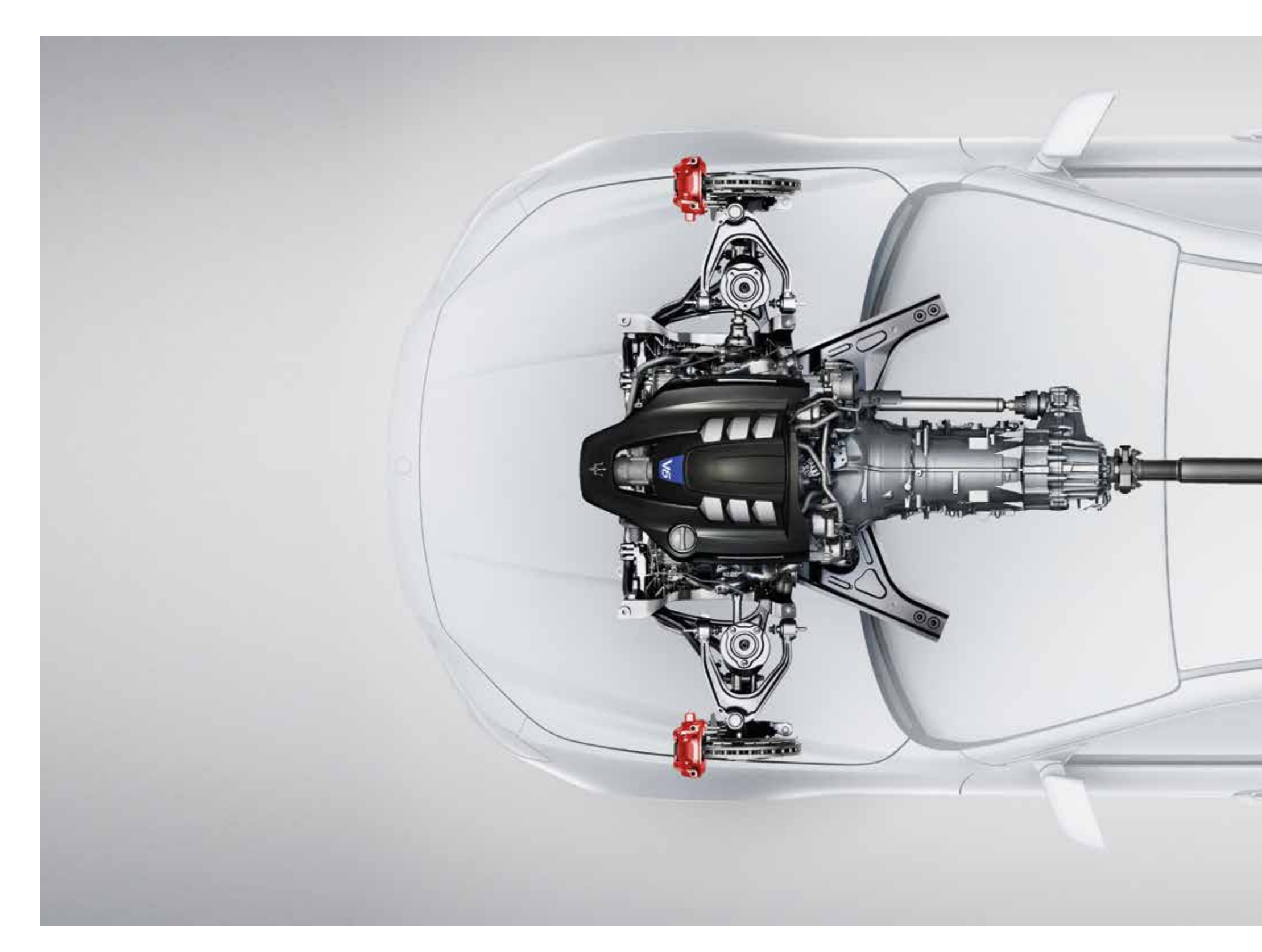
THE GHIBLI S Q4 FEATURES MASERATI INTELLIGENT ALL-WHEEL DRIVE TO SUPPLY TRACTION SEAMLESSLY ON DEMAND.