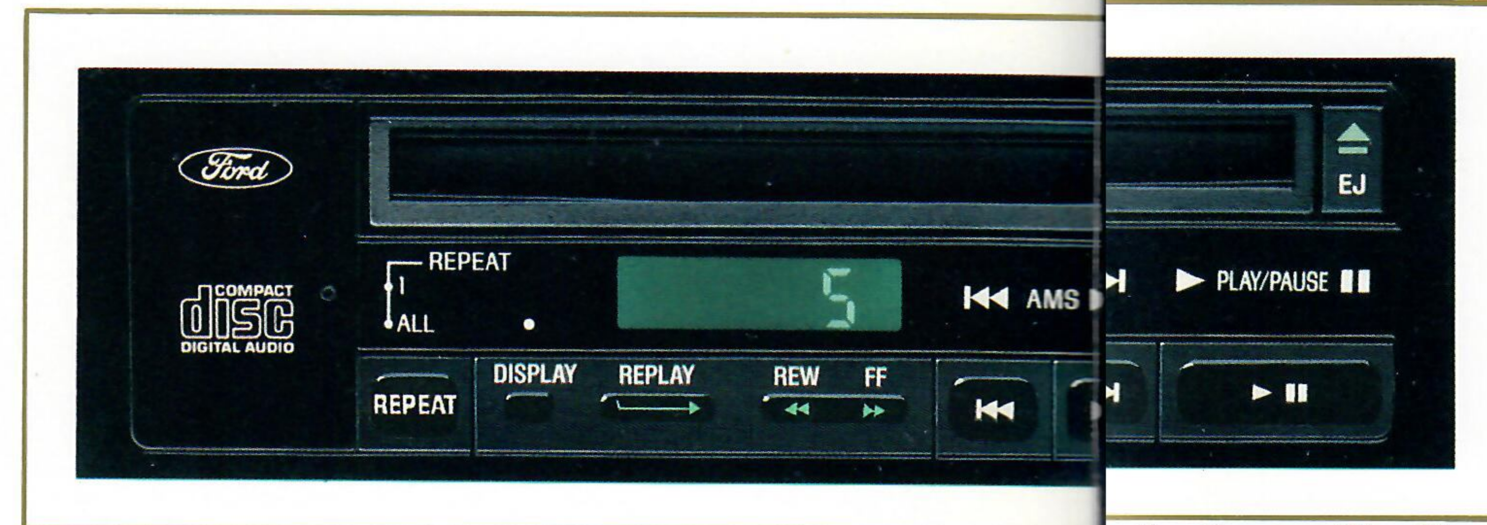
Lincoln Town Car Compact Disc Player