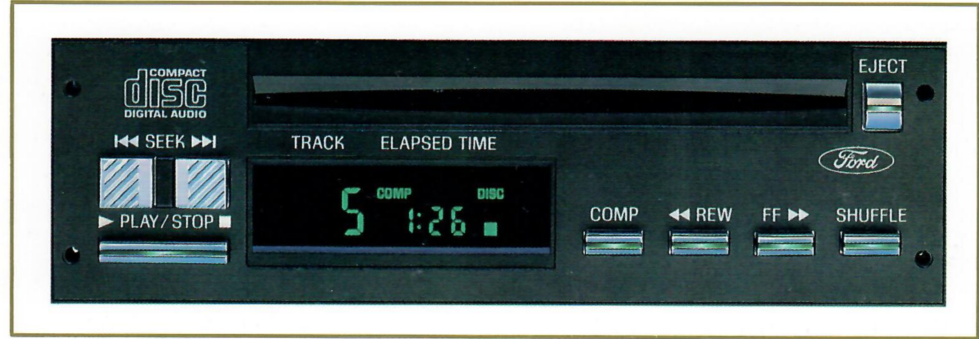
Lincoln Continental Compact Disc Player