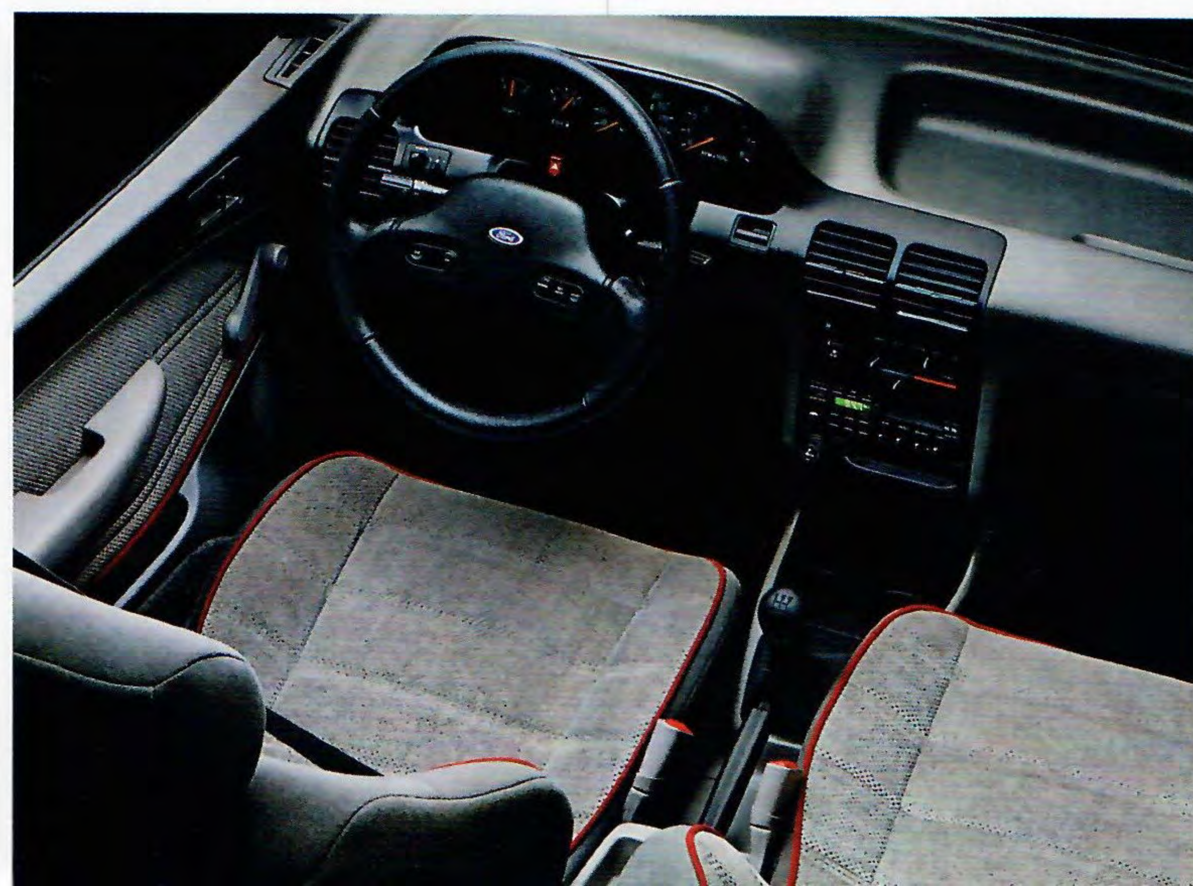
Escort GT's well-appointed interior includes a bin with removable cup holder tray in the center console as well as the light group. It's shown here with the GT Preferred Equipment Package.