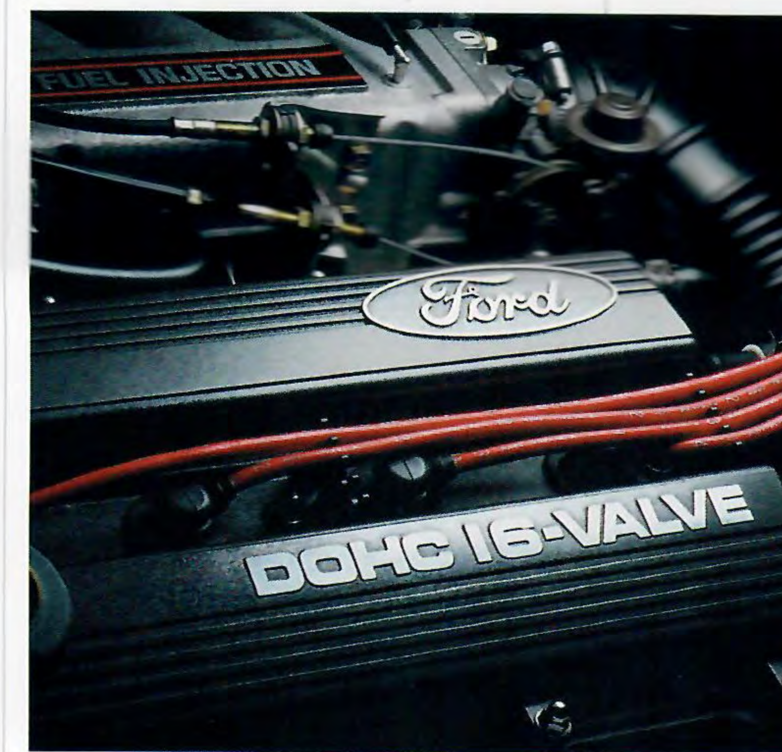
The purposeful appearance of the 1.8 liter DOHC 16-valve engine is an accurate indication of what goes on inside. It delivers 127 hp at 6,500 rpm for maximum performance.

Precise power rack-and-pinion steering and a sport handling suspension give GT its agility. Power disc brakes at all four wheels and performance radial tires also enhance its roadability.