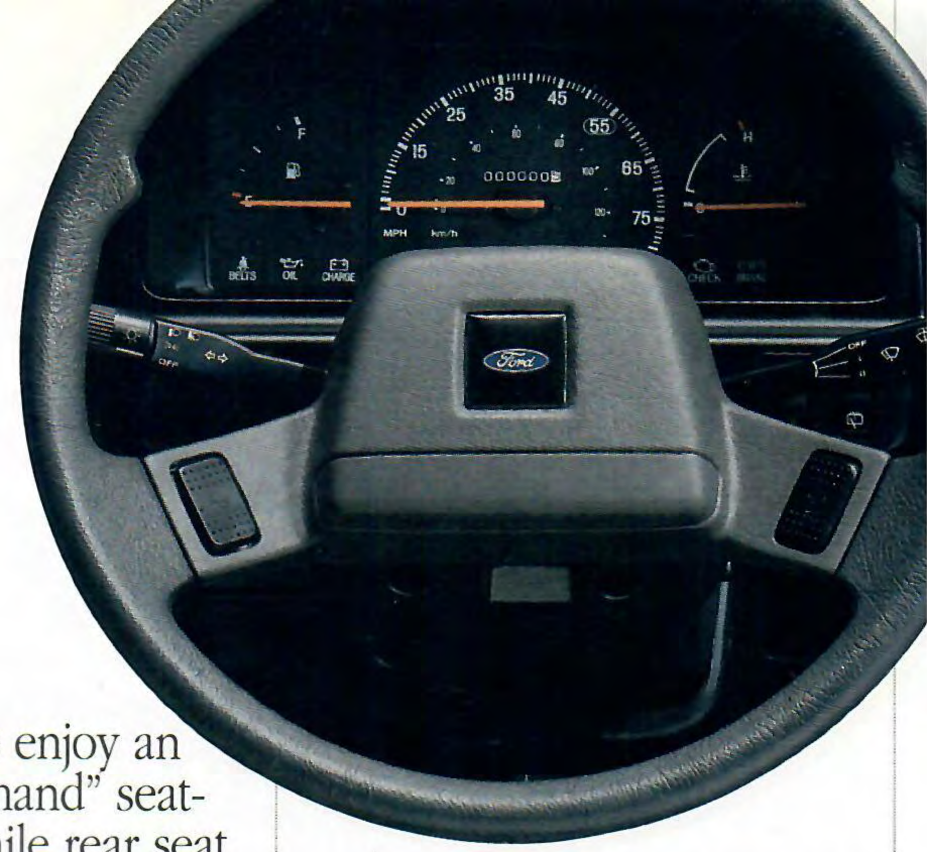
The layout of Festiva's instrumentation is the result of careful planning and applied ergonomics.

making it easier for rear passengers to get in and out. For cargo, Festiva offers unusual versatility and spaciousness. The entire rear seat assembly can be folded up toward the front seat backs for maximum cargo capacity and a flat floor. Festiva instrumentation,