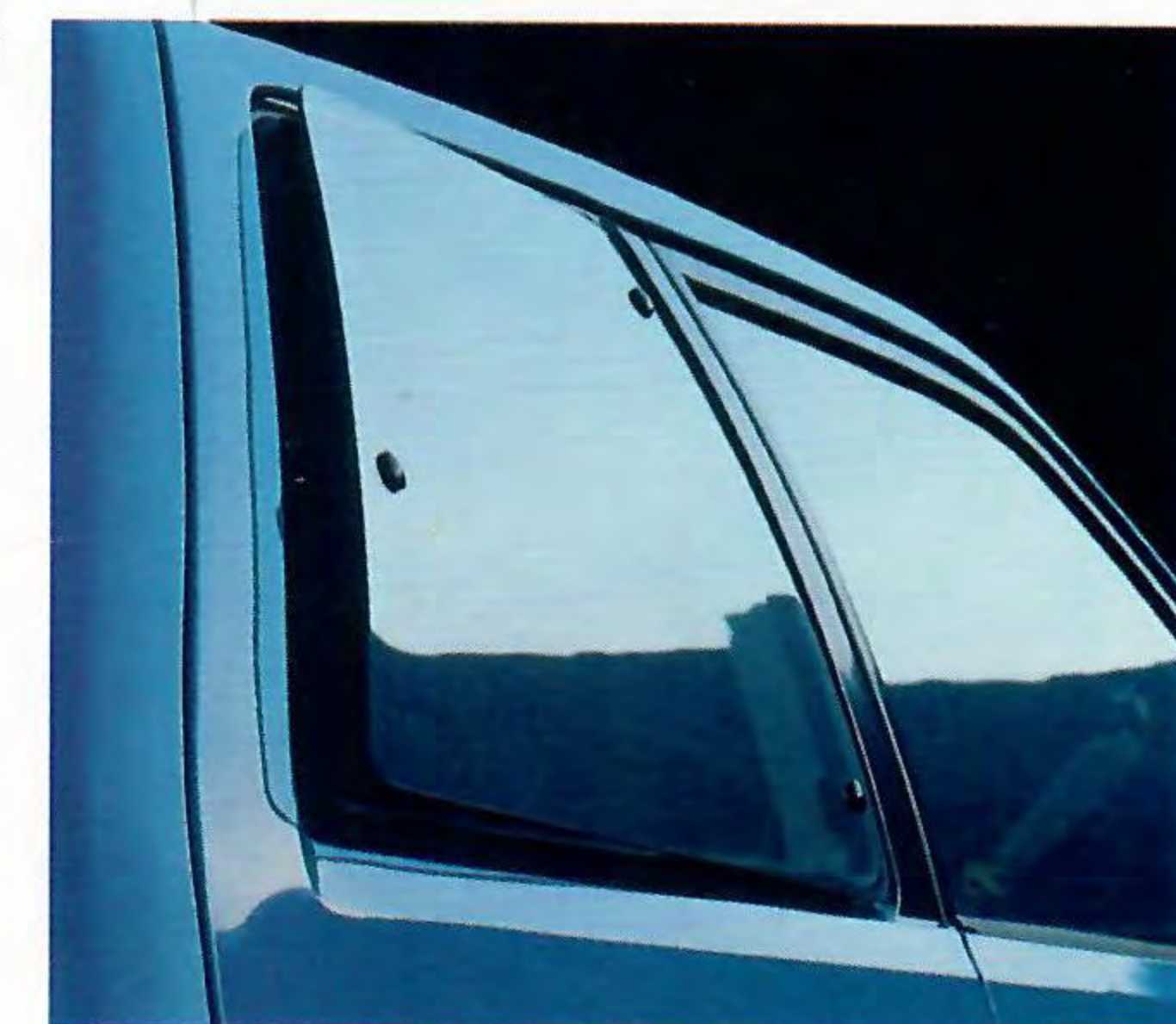
Festiva's rear quarter windows open for enhanced ventilation.

The system, of course, is not intended to function alone. Use it in conjunction with the manual lap belt.