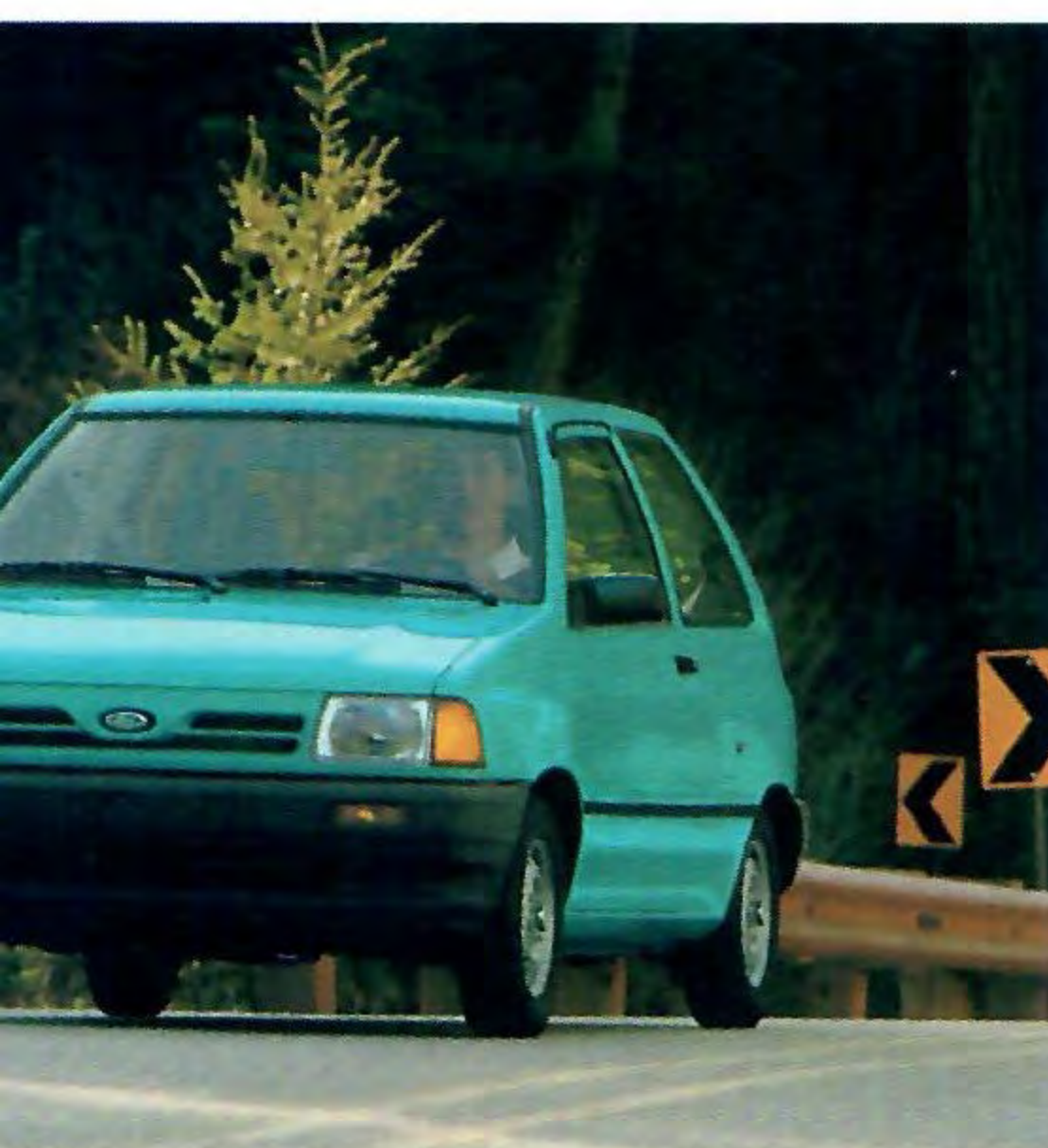
A wide stance and capable suspension provide excellent handling and balance.