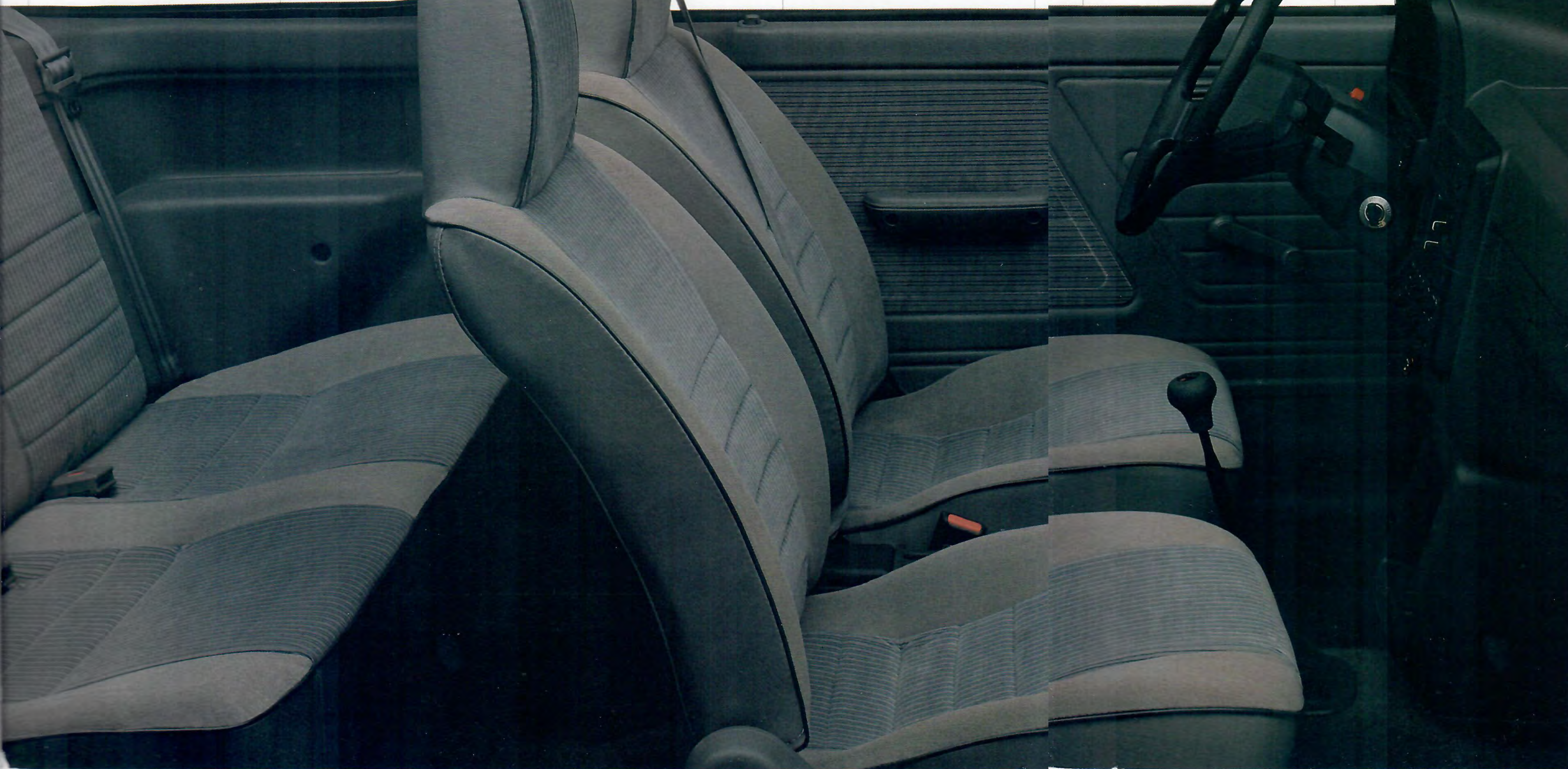
The Festiva GL interior features cloth and vinyl upholstery. It's shown here in Medium Grey.