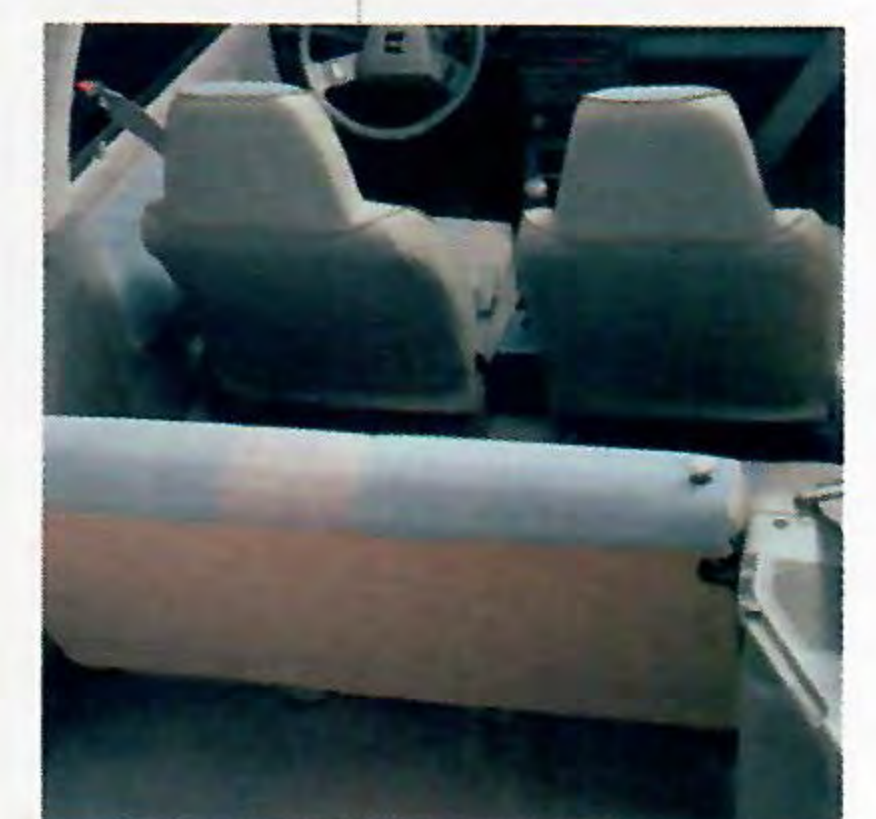
Festiva's entire rear seat assembly can be folded up toward the front seat backs for maximum cargo capacity and a flat load floor.