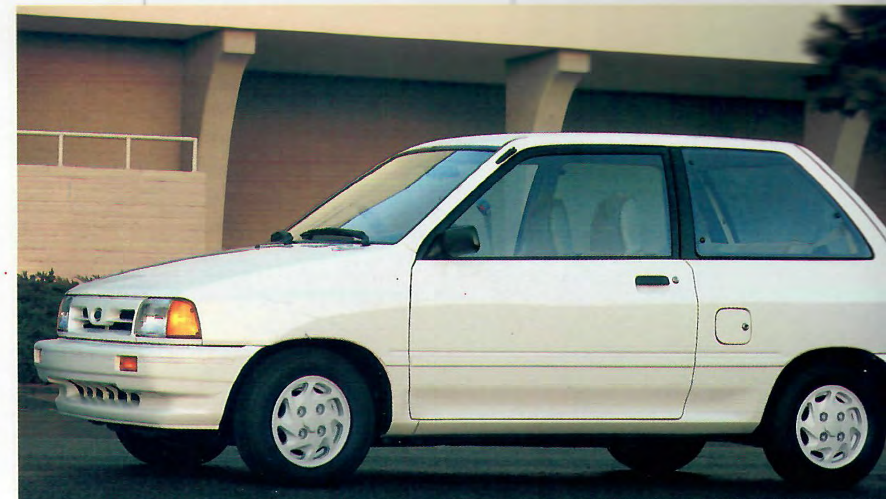
Festiva GL shown in White. New aluminum wheels enhance GL's exterior styling.

Much of what makes Festiva such a satisfying purchase, however, goes well beyond the practical considerations of the car. Because in Festiva's case, great utility does not preclude attractive styling and real driving enjoyment. That's especially true this year, with the introduction of the appearance-enhancing Sport Option Package, with its special interior, rear spoiler and tape stripe