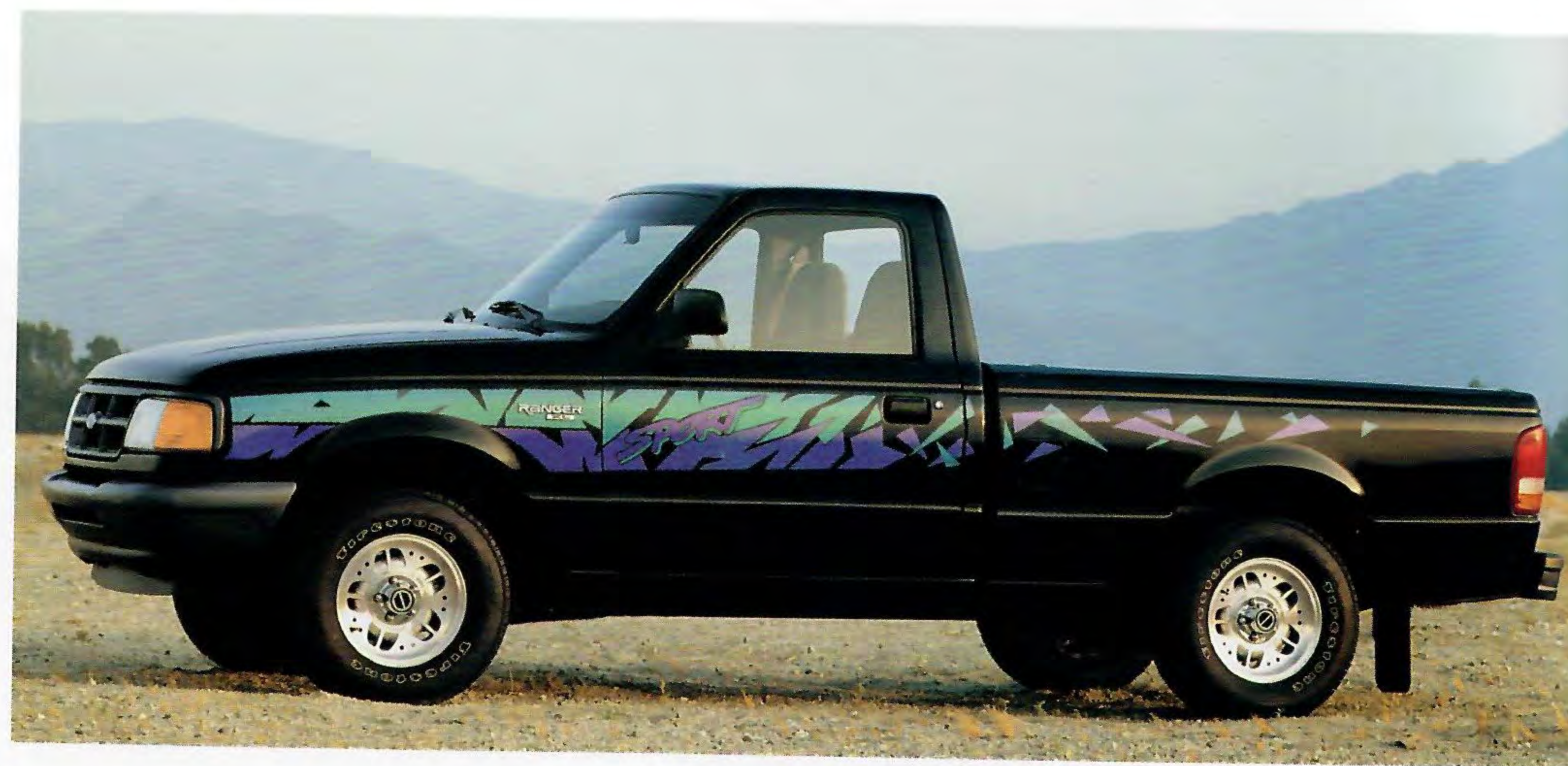
The Ranger XL Sport shown in Raven Black features a tape stripe treatment which may be deleted (bottom photo).

XL Sport has all the XL standard features plus an electronic AM/FM stereo radio with cassette tape and digital clock as well as larger P215/70x14SL tires (on 4x2 models).