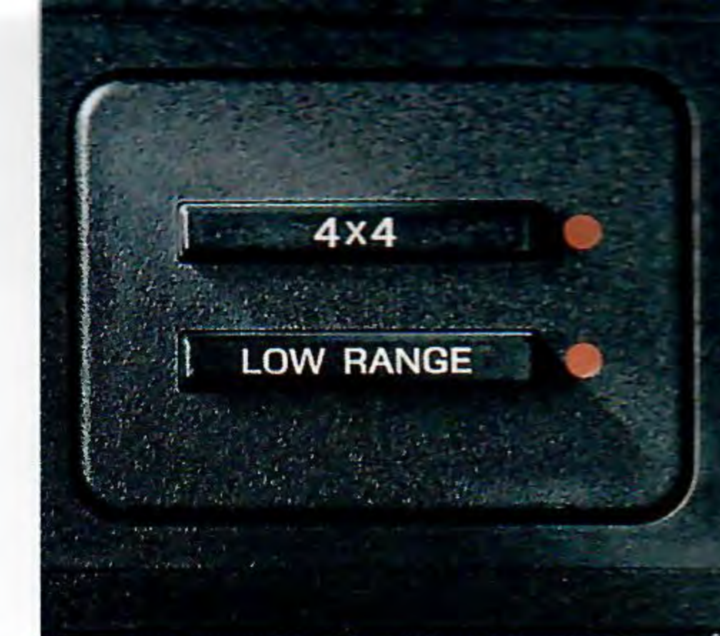
Auto-locking hubs with touch-drive transfer case are standard on Ranger 4x4s.

Some equipment shown on these pages is optional.