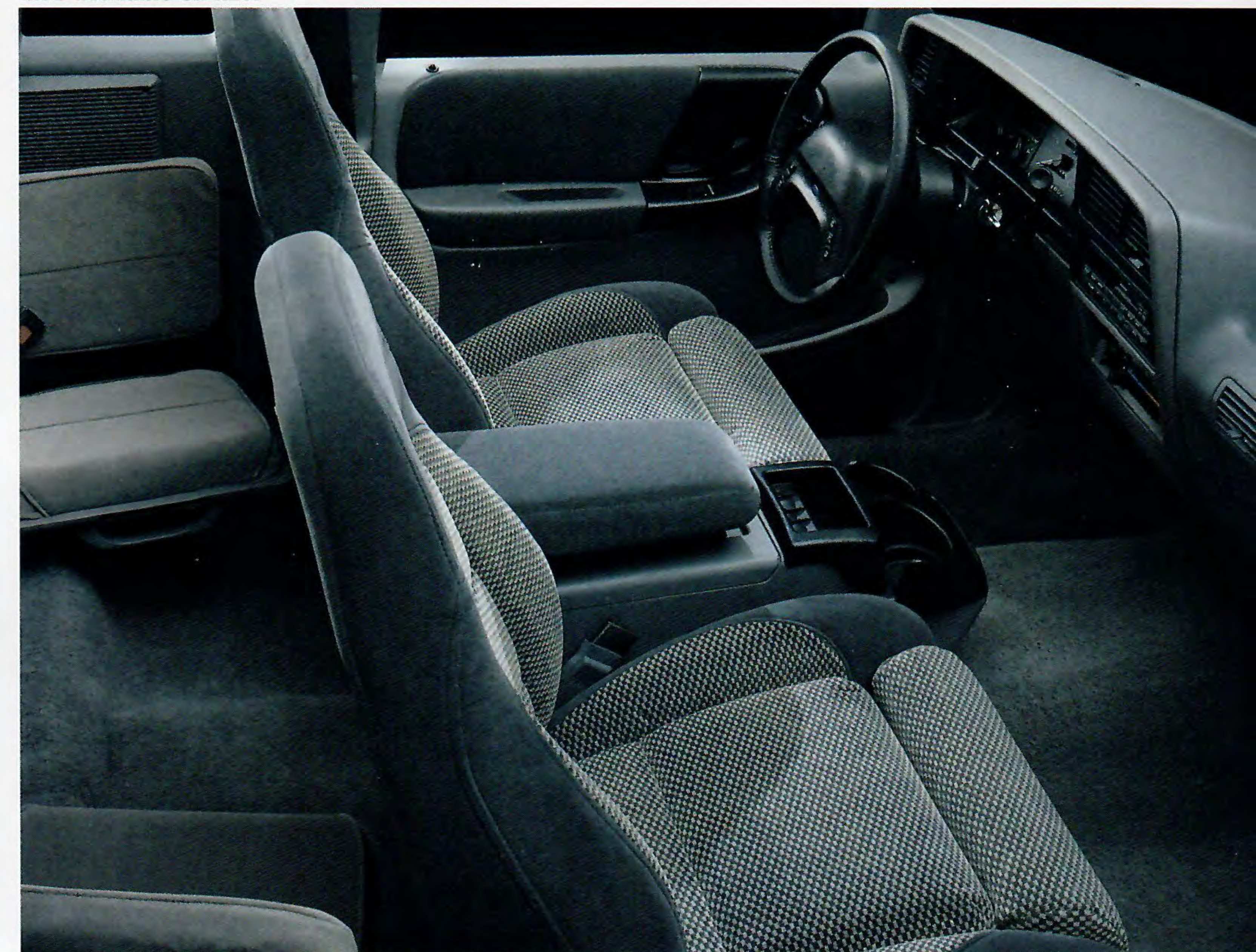
Below: Ranger sport bucket seats in Opal Grey. Included in the STX Preferred Equipment Package, sport buckets are also available on XLT.