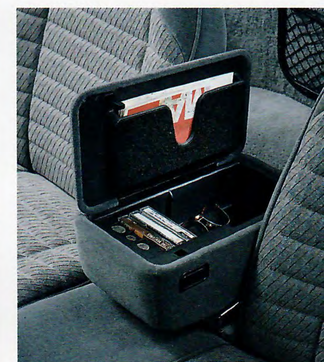
Above: the 60/40 split bench seat includes a center armrest with a convenient storage compartment.