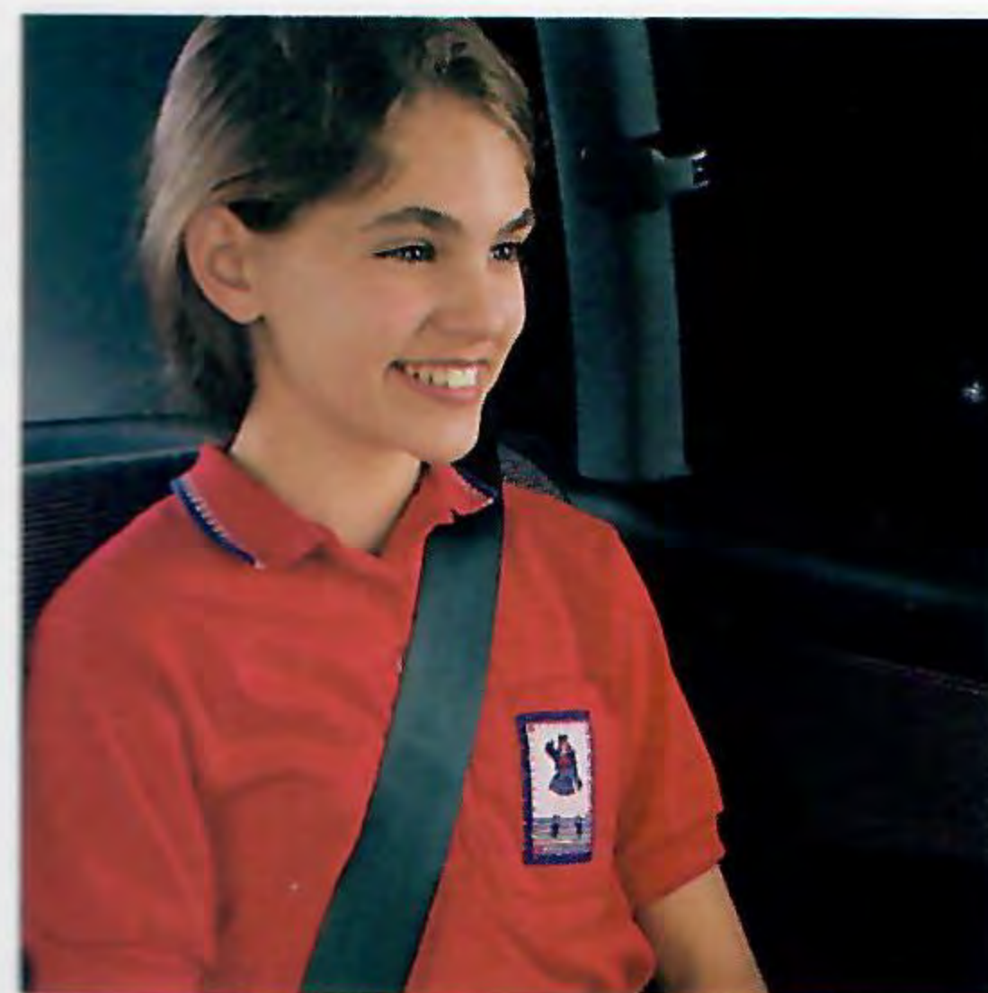
Standard active lap and automatic passive shoulder belts secure front-seat passengers. Rear-seat outboard passengers have a three-point active Unibelt restraint system.