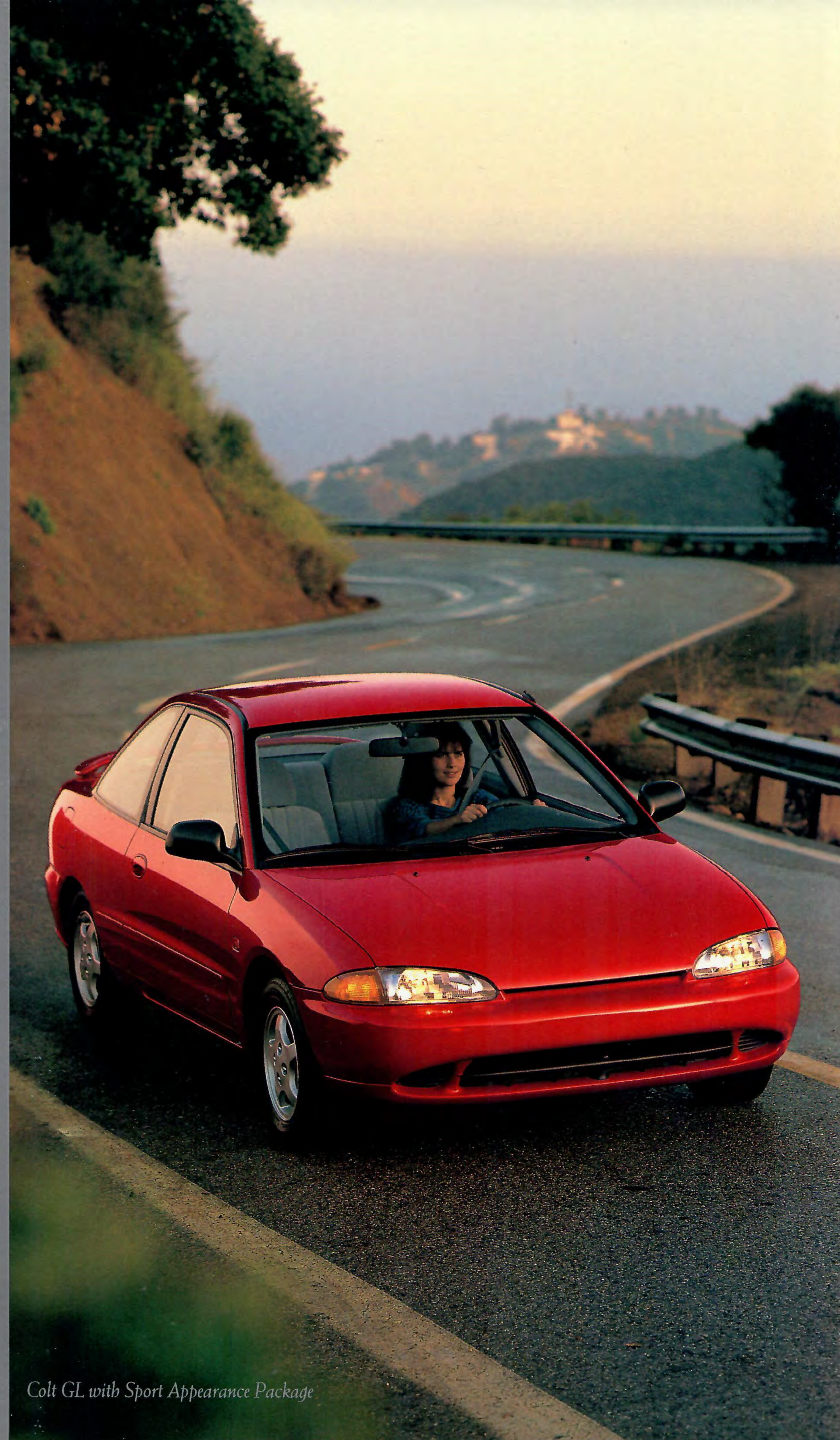
Colt GL with Sport Appearance Package

IMAGINATIVE NEW STYLING AND SOLID ENGINEERING