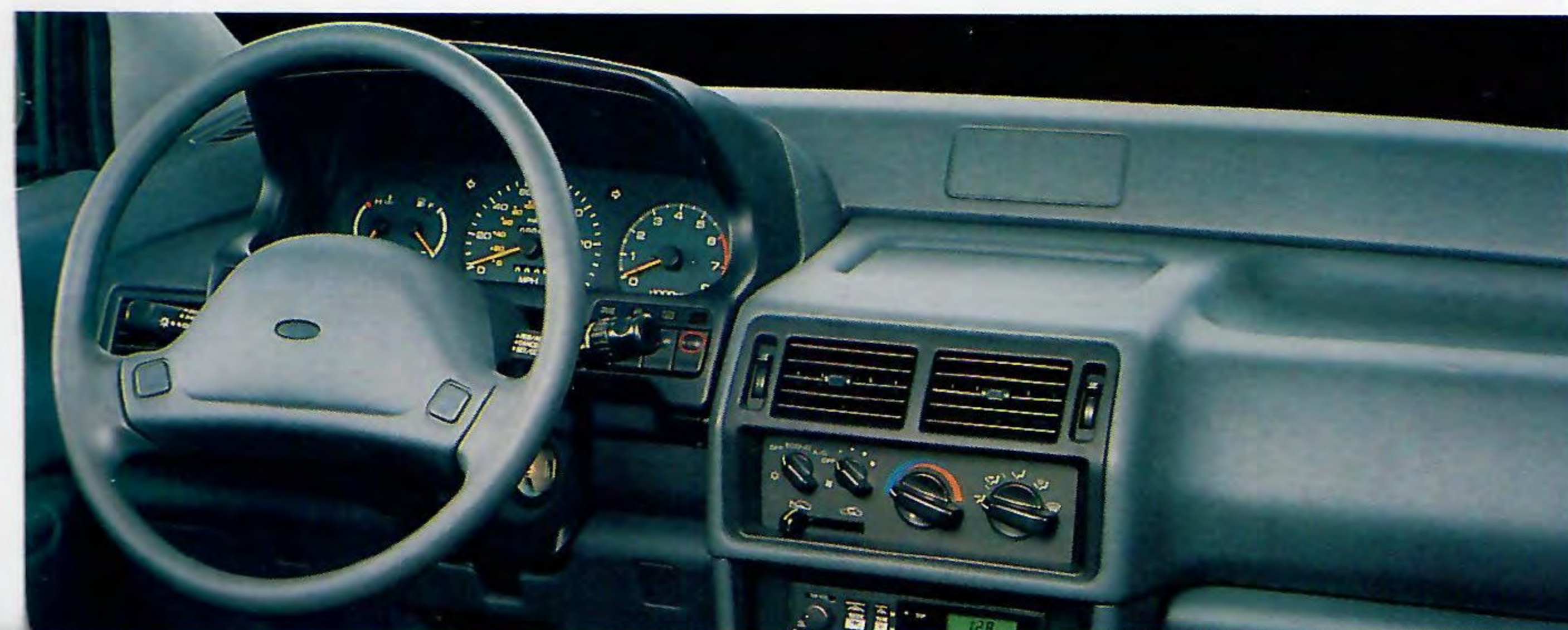
The contoured Vista SE instrument panel puts controls at the driver's fingertips. A trip odometer, glove box, dual cup holders, tilt steering column, and power liftgate lockswitch are all standard. An AM/FM stereo radio with cassette tape player is available on all Vista models.