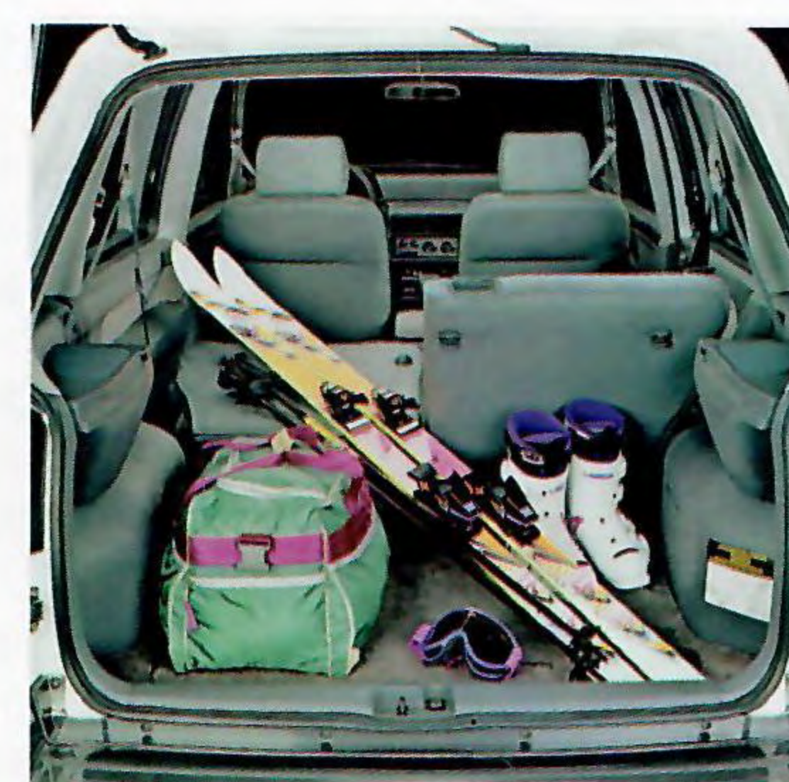
Split-back rear bench seat allows room for long cargo (see page 11 for availability). New pull handle makes the liftgate easy to close.

Colt Vista wagon's lively performance is inspired by a 1.8-liter 16-valve SOHC MPI engine teamed with a five-speed manual overdrive transaxle, both standard on Vista FWD and AWD models. A 2.4-liter 16-valve SOHC MPI engine is standard on Vista SE FWD