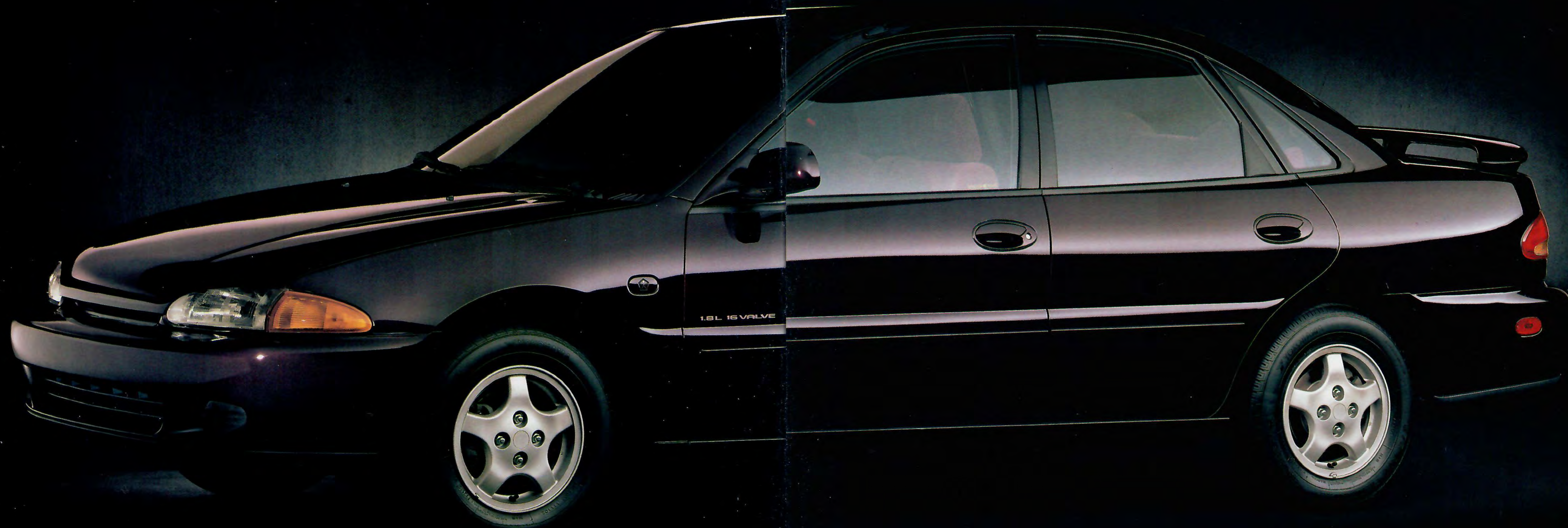
Colt GL with Sport Appearance Package