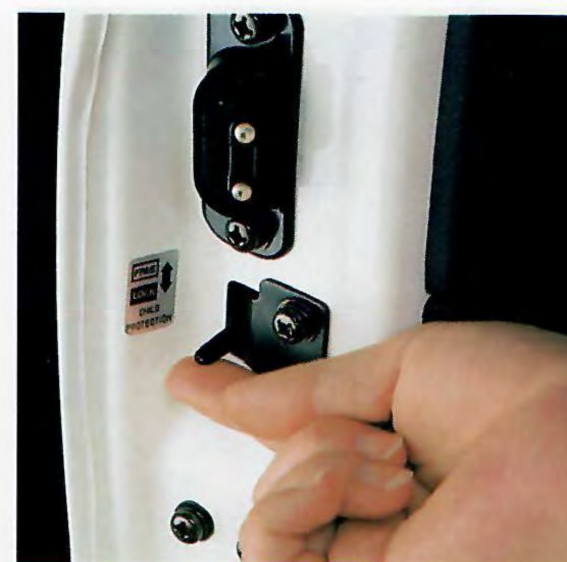
Standard child-protection lock in the rear sliding side door safely disables the inside door handle to protect kids in the rear seat.