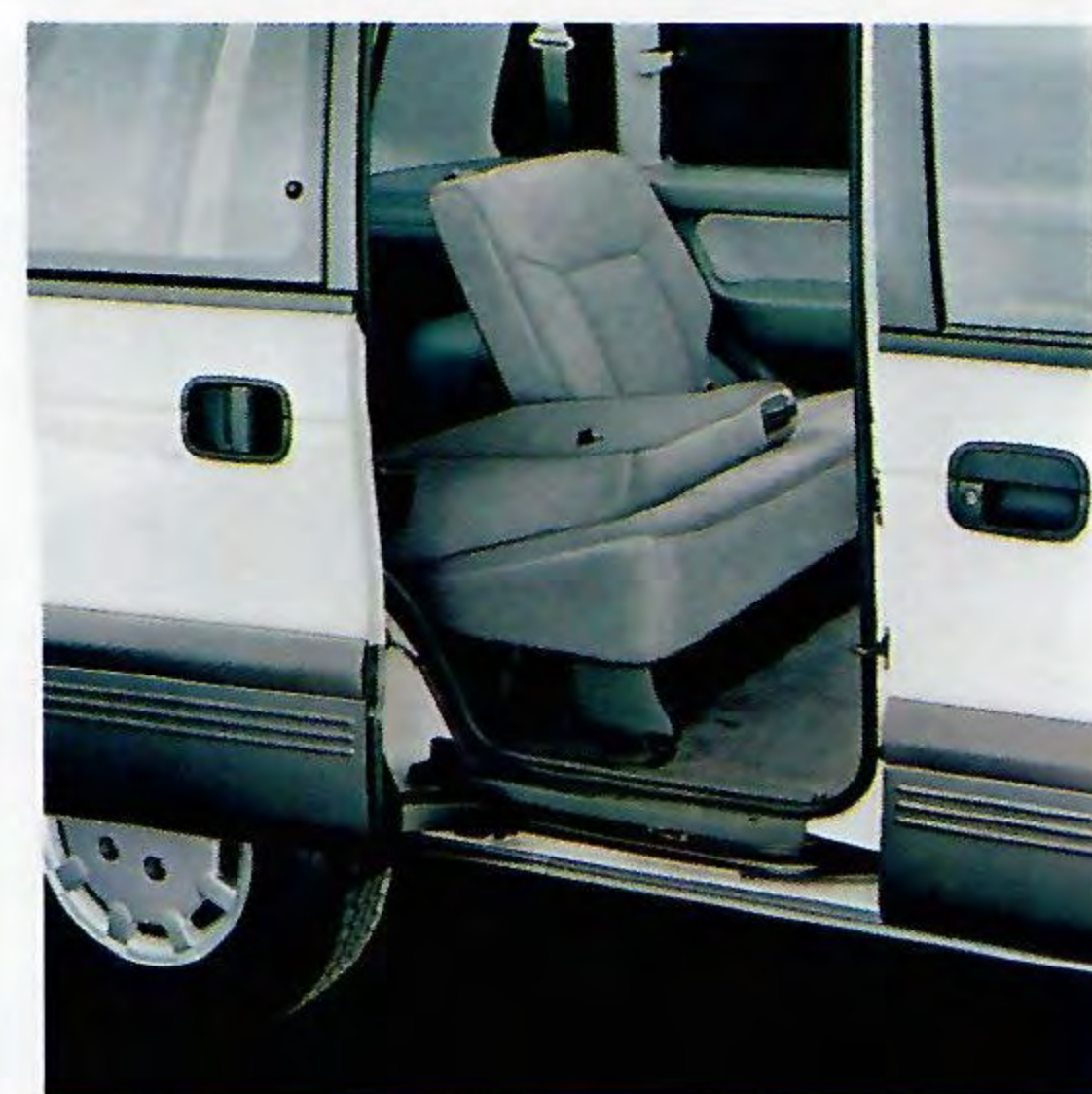
Vista's unique standard sliding side door with "bill-holding" feature allows easy access for people and cargo. Not offered by other midsize wagons.

Vista SE's flat floor and tall, van-like cabin comfortably seat up to five adults, with 40.8 inches of front-seat leg room and over three feet of rear-seat leg room. And this interior is a model of passenger- and cargo-carrying versatility. When removed, the fold-and-