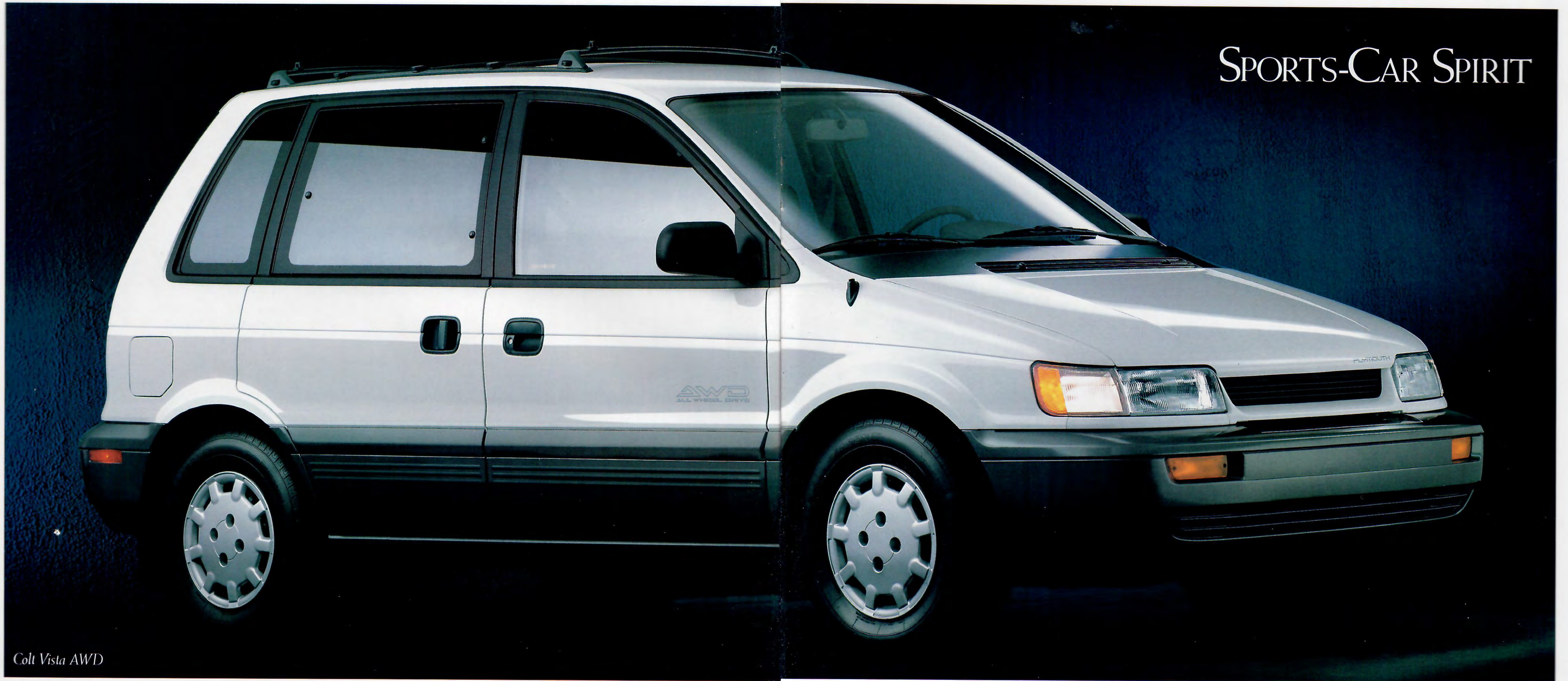
Colt Vista AWD