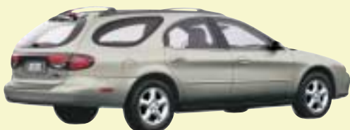
TAURUS SE WAGON IN SPRUCE GREEN CLEARCOAT METALLIC