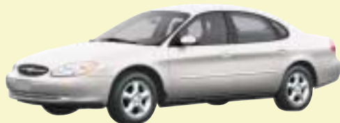
TAURUS SES IN VIBRANT WHITE CLEARCOAT