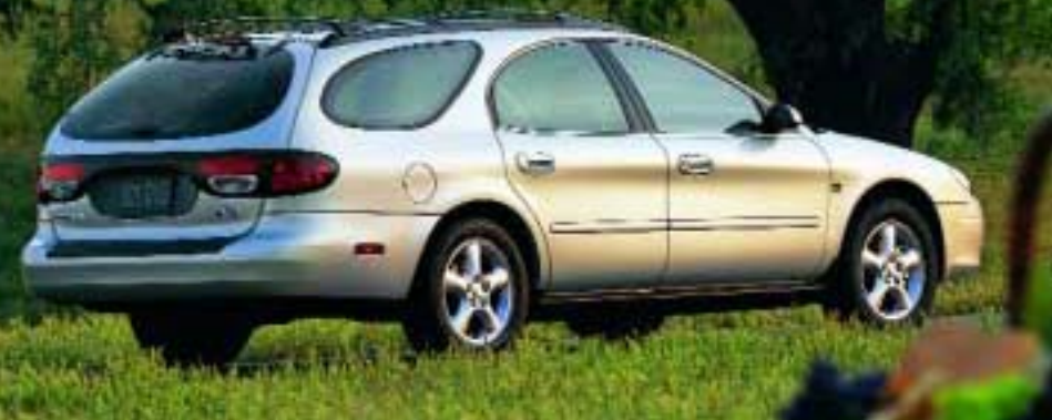
Taurus SE Wagon shown in Silver Frost Clearcoat Metallic.