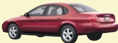
TAURUS SE IN CHESTNUT CLEARCOAT METALLIC