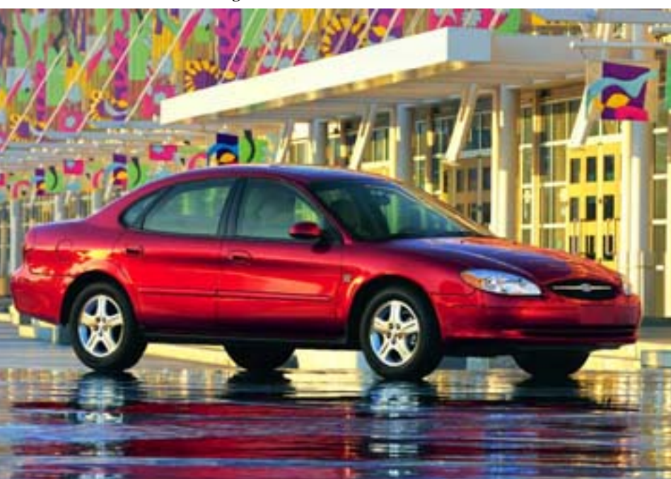
Taurus SEL shown in Toreador Red Clearcoat Metallic.