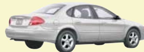
TAURUS SES IN SILVER FROST CLEARCOAT METALLIC