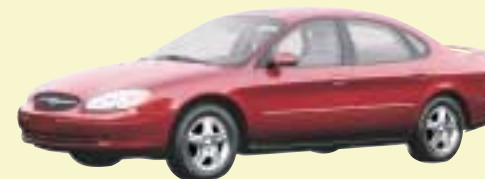
TAURUS SEL IN TOREADOR RED CLEARCOAT METALLIC