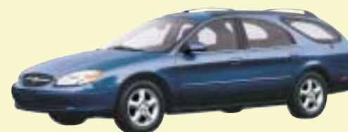
TAURUS SE WAGON IN MEDIUM ROYAL BLUE CLEARCOAT METALLIC