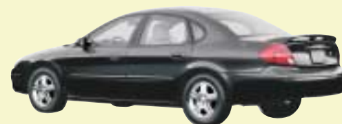
TAURUS SEL IN BLACK CLEARCOAT

Please note that all Taurus models are available in all exterior colors. Vehicles shown may include optional equipment.