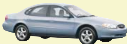
TAURUS SES IN GRAPHITE BLUE CLEARCOAT METALLIC