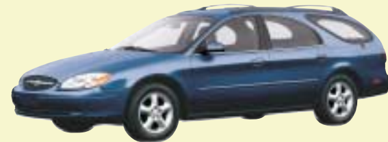
TAURUS SE WAGON