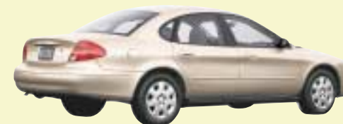
TAURUS LX IN HARVEST GOLD CLEARCOAT METALLIC