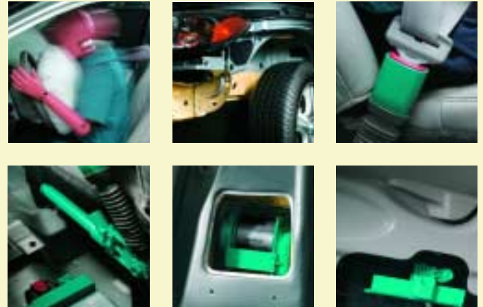
Our standard Personal Safety System includes (clockwise from upper left) dual-stage front airbags, crash severity sensor, safety belt usage sensors, driver seat position sensor, safety belt energy management retractors and safety belt pretensioners.