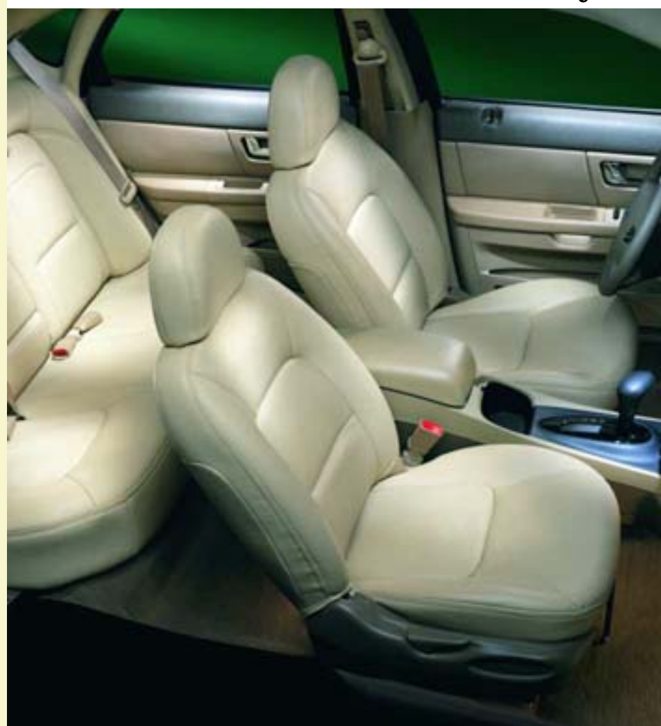
Taurus SEL shown with optional equipment including Medium Parchment leather-trimmed seats.

On your next journey surround yourself with safety and security.